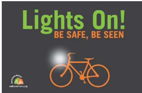
Figure 71. A Bike Light Campaign with free light giveaways is a win-win situation: bicyclists get free lights, and streets and paths get safer.

The majority of bicycle related crashes in the Rapid City Area occur in the fall as the skies get darker earlier, daylight savings ends, and bicyclists are harder to see. Many bicyclists, especially students, are unaware that lights are required by law, or they have simply not taken the trouble to purchase or repair lights. Research shows that bicyclists who do not use lights at night are at much greater risk of being involved in bike-car crashes.