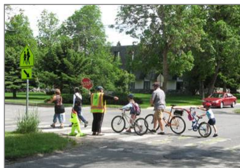
Figure 65. Safe Routes to School programs improve conditions for walking and bicycling near schools and in surrounding neighborhoods.

As a final step, an initial infrastructure improvement plan should be produced for each elementary school, including cost estimates and a prioritized project list. This infrastructure improvement plan will serve as a blueprint for future investments, and can be used to apply for further grant funding.