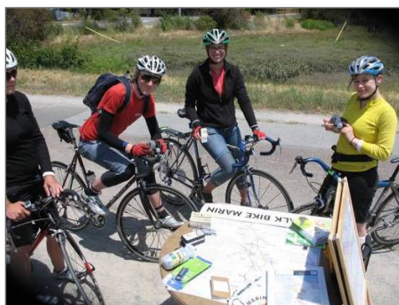
Figure 70. A “Share the Path” campaign encourages respectful behavior on multi-use paths.

Conflicts between path users can be a major issue on popular, well-used pathway systems like the Leonard “Swanny” Swanson Memorial Pathway. Communities around the country have launched successful “Share the Path” programs to help educate users about safety and courtesy. Share the Path campaigns can be run by agencies, nonprofits, or any user group (equestrian, hikers, etc.). These programs educate users about expected behavior and how to limit conflicts. Volunteers often give out brochures and engage with users in a non-confrontational way. Volunteers can also report back to agencies about path maintenance or safety/security issues. Media outreach should be included as well. Common strategies include a bicycle bell or bike light giveaway, the distribution of maps and information, posting signs, tabling, and ‘stings’ that reward good behavior.