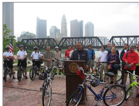
Figure 64. Bike Month activities build excitement around bicycling, and are an opportunity for novices to get support and encouragement.