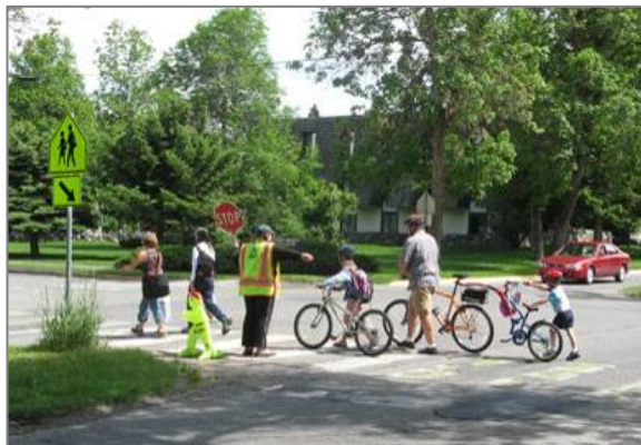
Figure 72. Safe Routes to School programs improve conditions for walking and bicycling near schools and in surrounding neighborhoods.

As a final step, an initial infrastructure improvement plan should be produced for each elementary school, including cost estimates and a prioritized project list. This infrastructure improvement plan will serve as a blueprint for future investments, and can be used to apply for further grant funding.