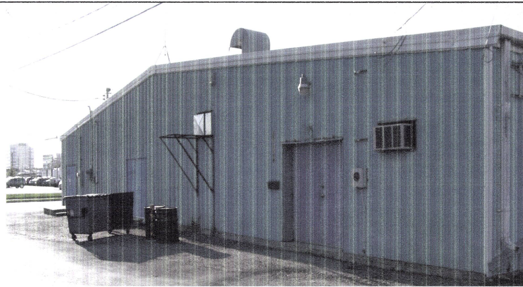
EXISTING NORTH EXTERIOR ELEVATION SCALE: NTS