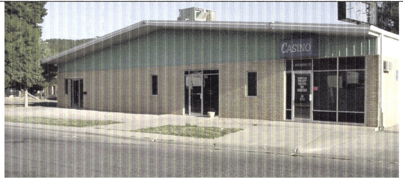
EXISTING SOUTH EXTERIOR ELEVATION SCALE: NTS