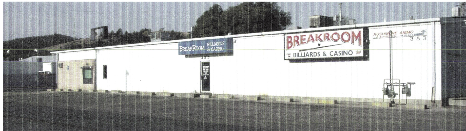
EXISTING EAST EXTERIOR ELEVATION SCALE: NTS