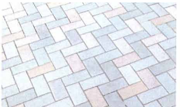
3"x8" Herring Bone