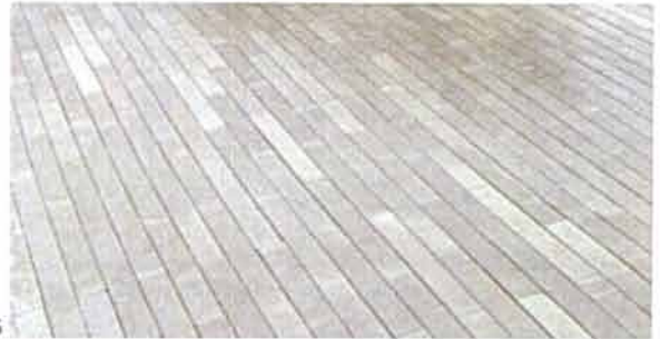
Narrow Concrete Pavers