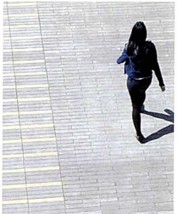
Narrow Concrete Pavers