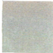
Units 2 and 4