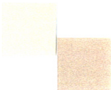
EIFS. Wall Finish Light Tan – Plateau 10606 (Sto)