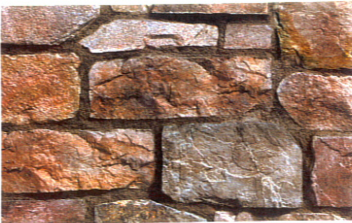
Stone Wall / Accents Tuscan Villa - Coronado