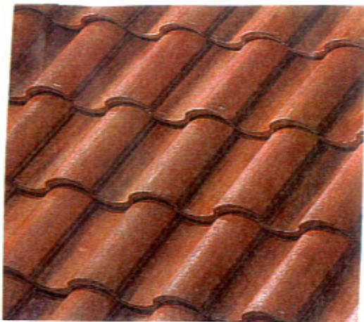
Concrete Roof Tile Casa Grande Blend - Monier Lifetile –