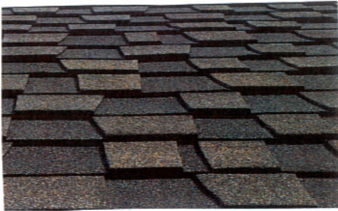
Asphalt Shingle Tiles Celotex – Shenandoah Blend