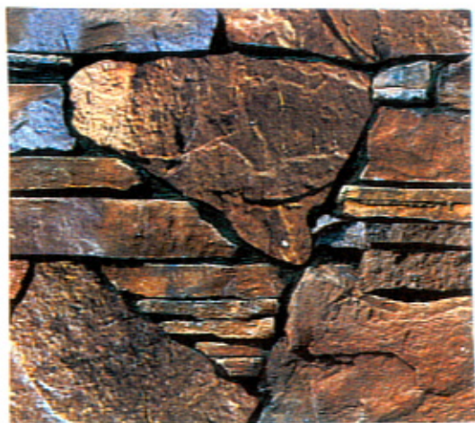
Stone Accents Fieldstone - Coronado