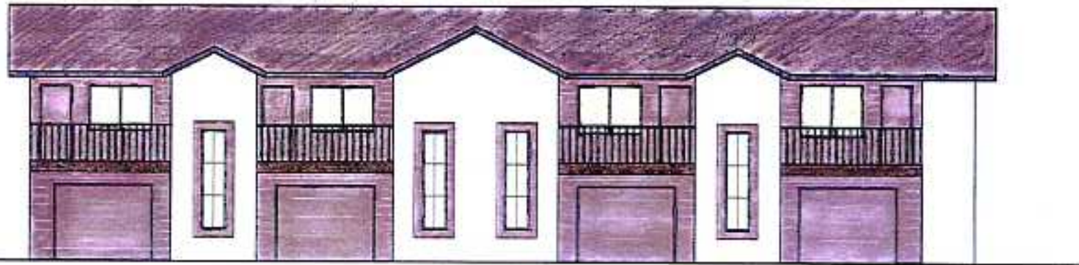
2 SOUTH ELEVATION B3.1 1/8"=1'-0"