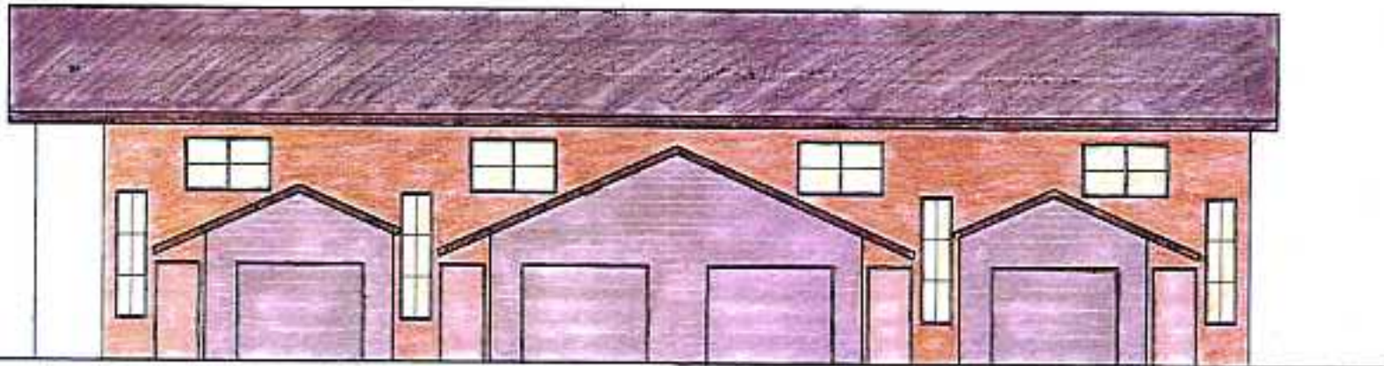
2 SOUTH ELEVATION A3.1 1/8"=1'-0"