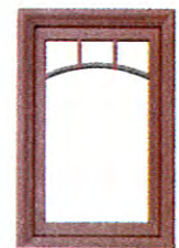
RIDGELAND CASING IN CADET GRAY