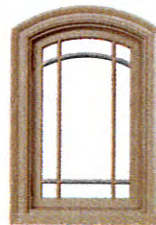
COLUMBUS CASING IN HAMPTON SAGE

Marvin offers 19 clad color options, 9 casing profiles, and 6 subsills.