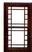
GRAYSON CASING IN BRONZE