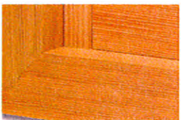
VERTICAL GRAIN DOUGLAS FIR