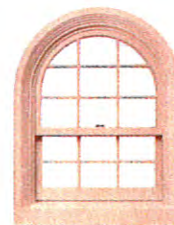
KINSLEY CASING IN CASHMERE