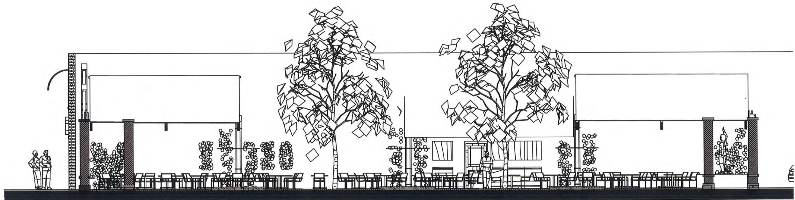
1 WEST ELEVATION 1/4" = 1'-0"