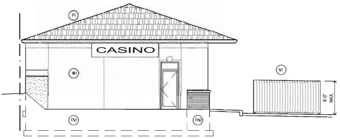
REAR (SOUTH) ELEVATION SCALE: 3/32" = 1'-0"