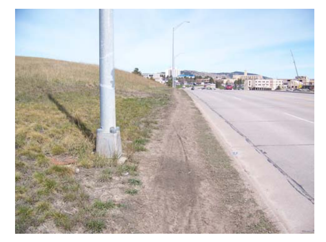
View looking north from Black Hills Oral/Maxillofacial Surgery Clinic.