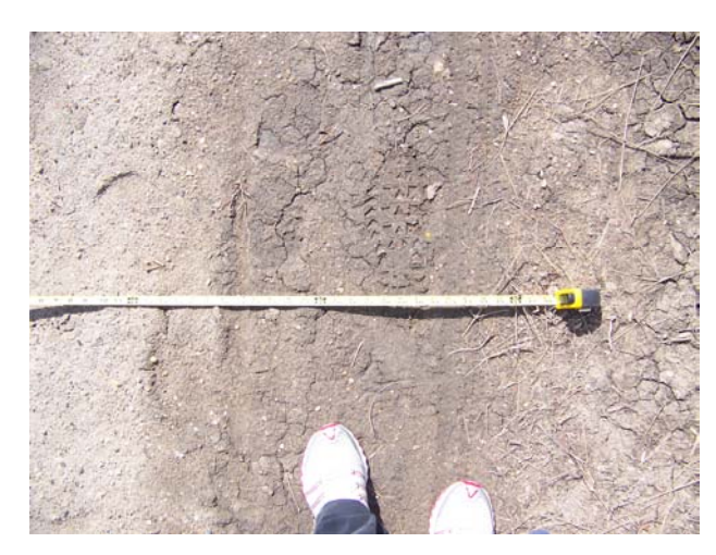
Shows narrowest distance between center of dirt path and a shoulderless road.