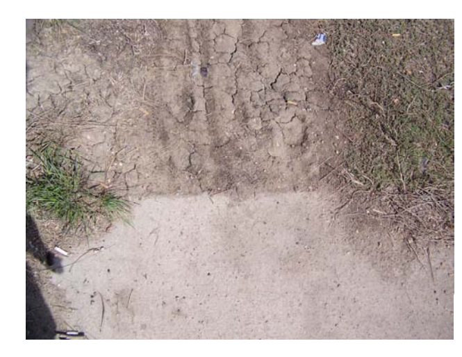
End of sidewalk at Black Hills Oral/ Maxillofacial Surgery Clinic.