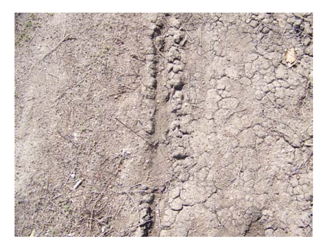
More bicycle tracks through the mud.