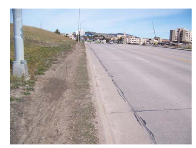
Shows lack of shoulder to serve as a buffer between foot— and vehicle traffic.