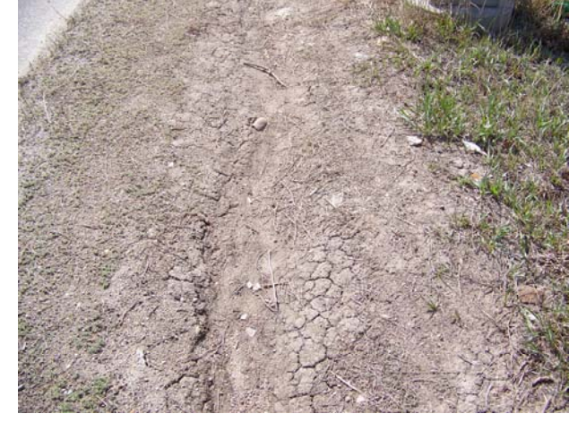
Shows how worn the path is relative to surrounding land.