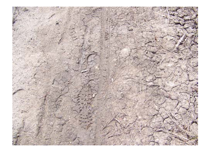
Although I've never seen a cyclist personally, here we can see both pedestrian and bicycle tracks.