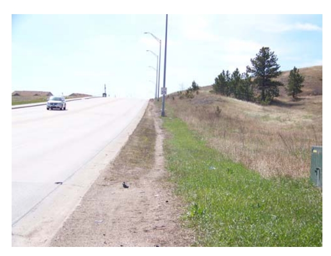
Looking south from the point where existing sidewalk ends at Dakota Radiology property.