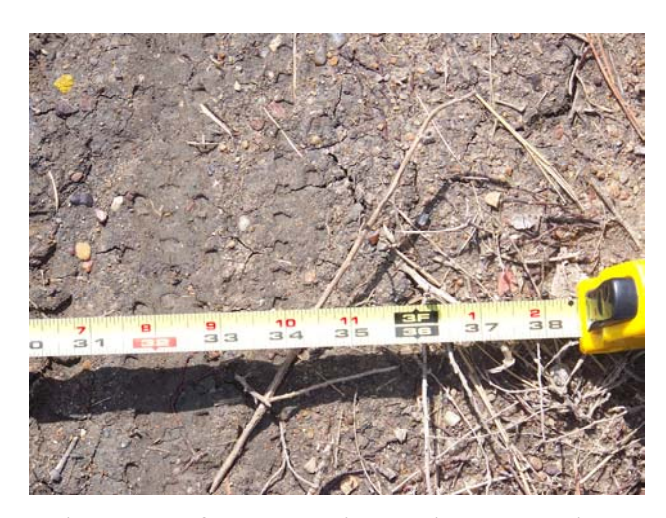
Blown up from previous photo—only 3 feet separate pedestrians from traffic in wet and icy conditions.