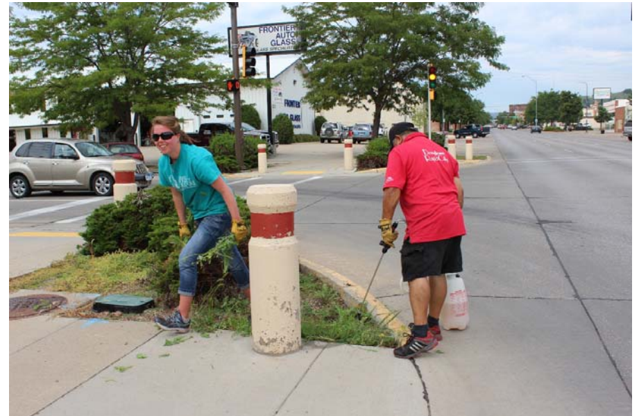
Picking and spraying for weeds in nodes