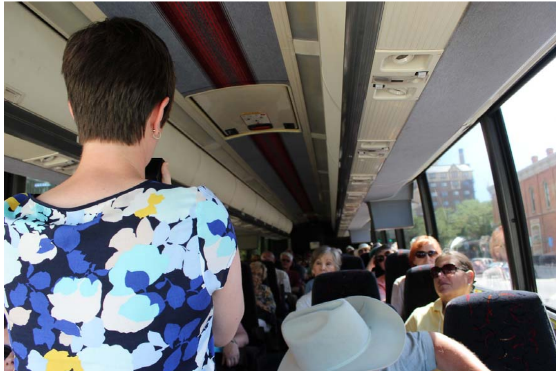
Destination Rapid City staff greets buses weekly