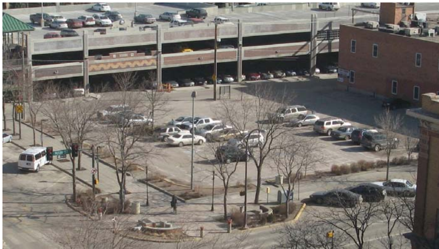
Parking lot, 2010