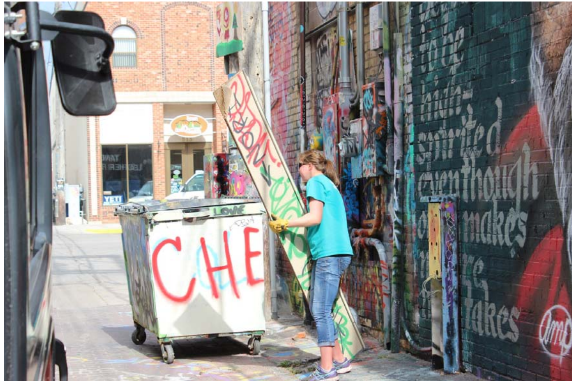
Art Alley Clean Up