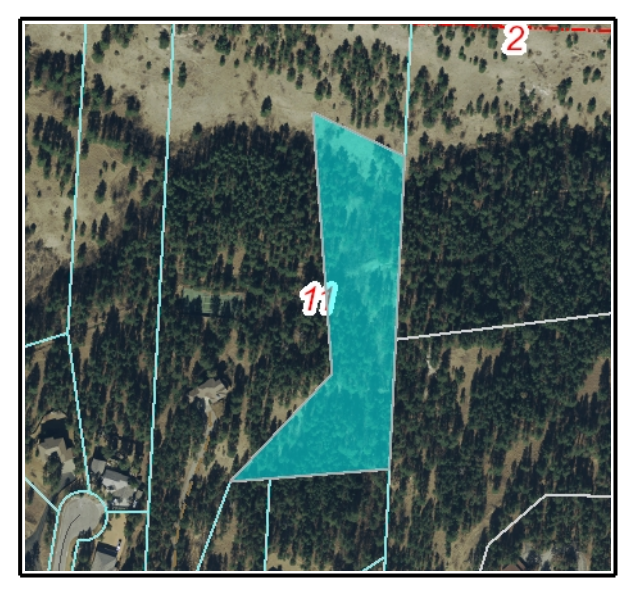
Parcel highlighted in blue