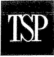
EXHIBIT C 2015 TSP Standard Billing Rates