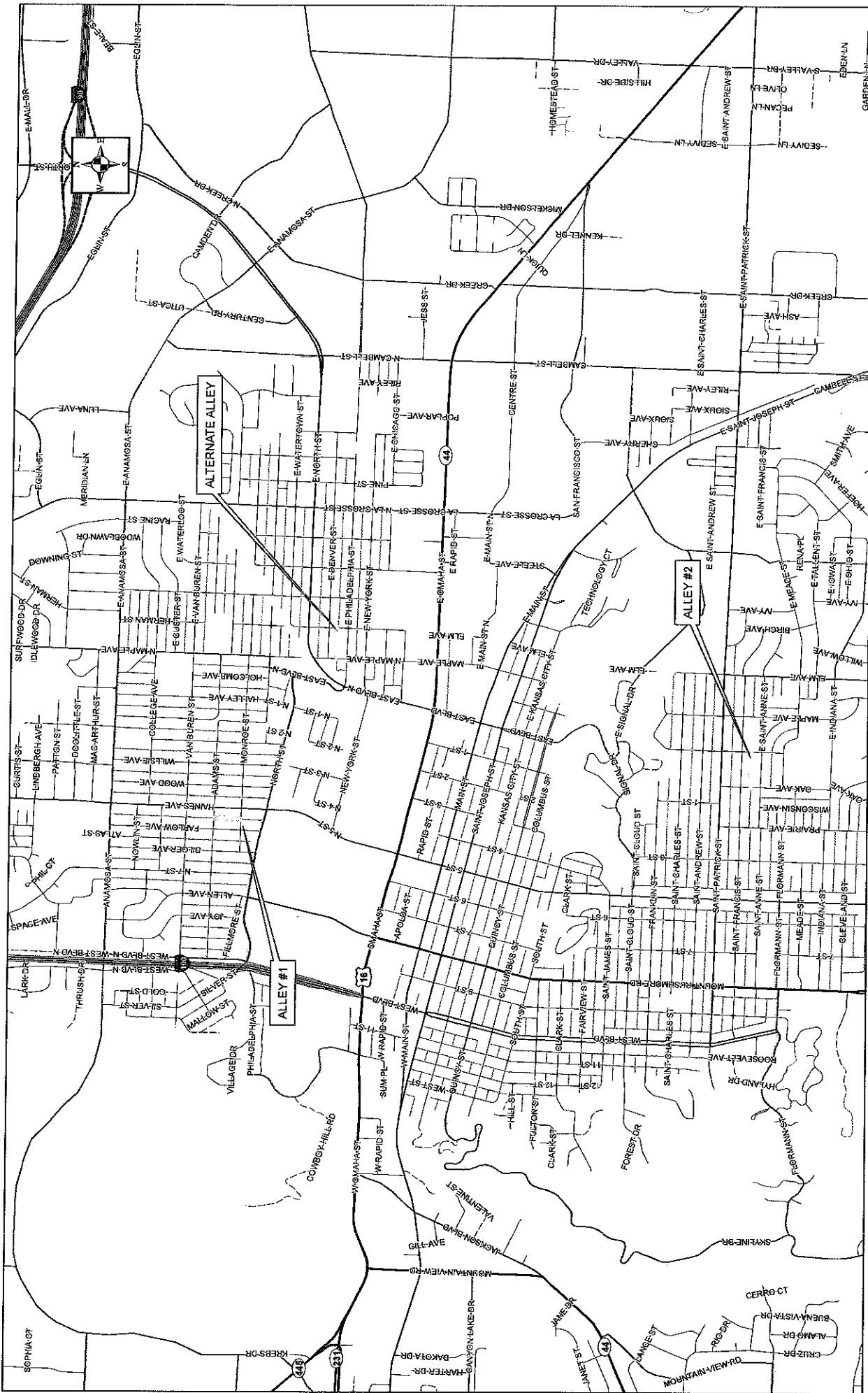
2014 Out of The Dust Overall Map