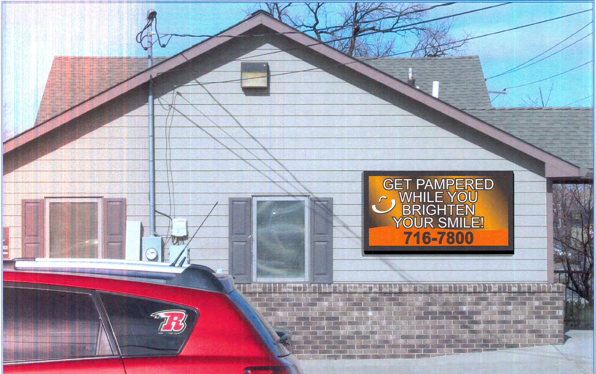
3' 7 5/16" x 6' 9 1/8" Full Color message center