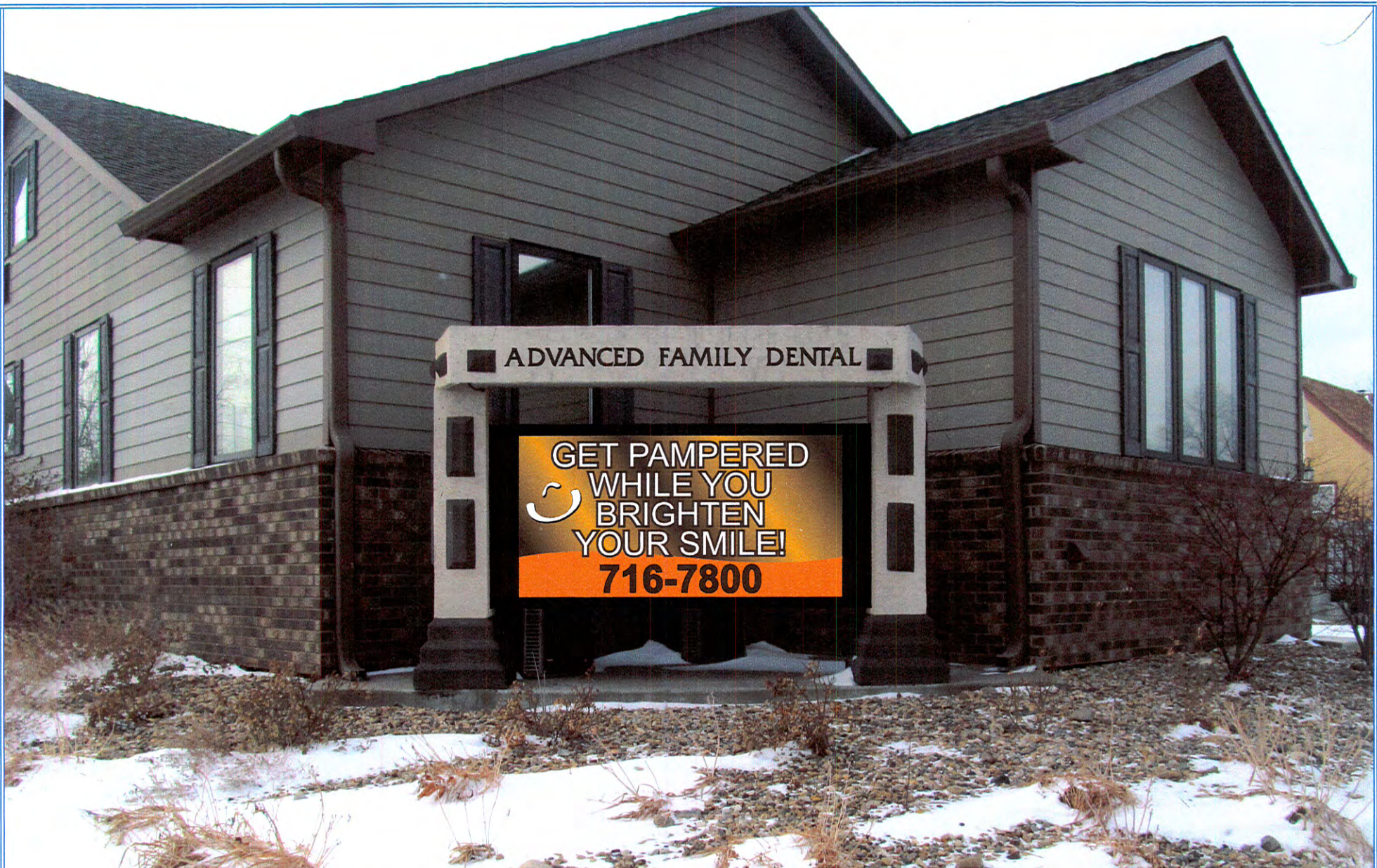
4" Duranodic Bronze Gemini Letters (Friz Quadrata) • 3' 7 5/16" x 6' 9 1/8" Full Color message center