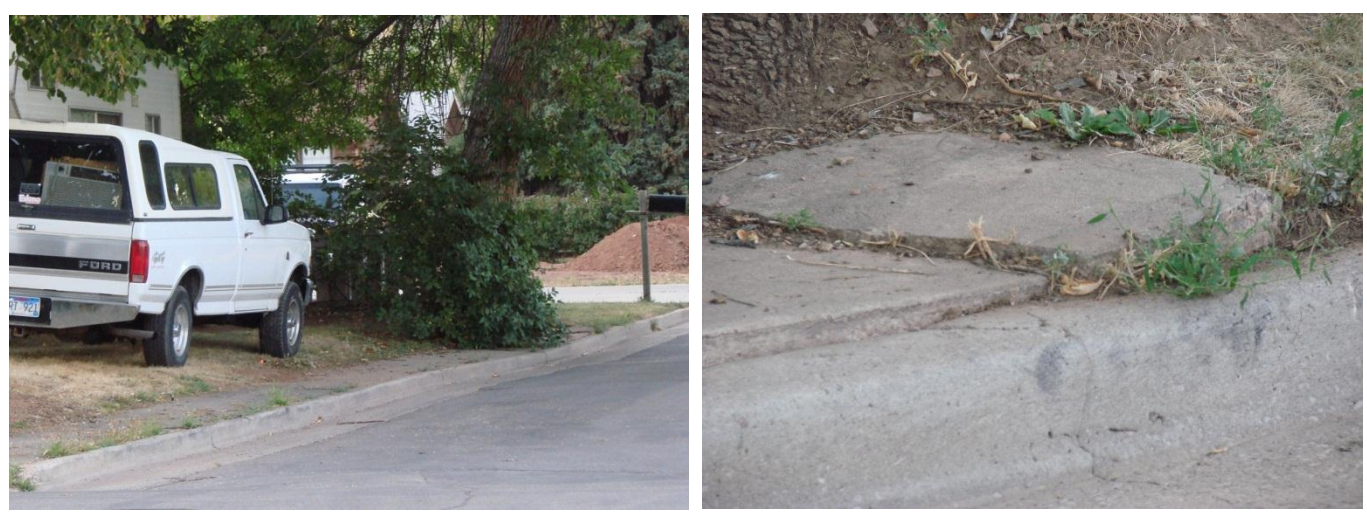
Elmhurst Drive Section

The only existing sidewalk on Elmhurst Drive between Minnekahta Dr and Canyon Lake Drive