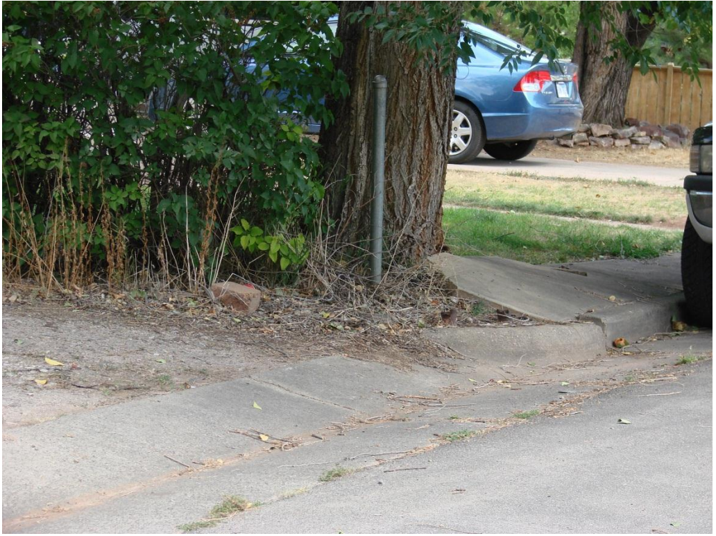
Minnekahta Drive Section