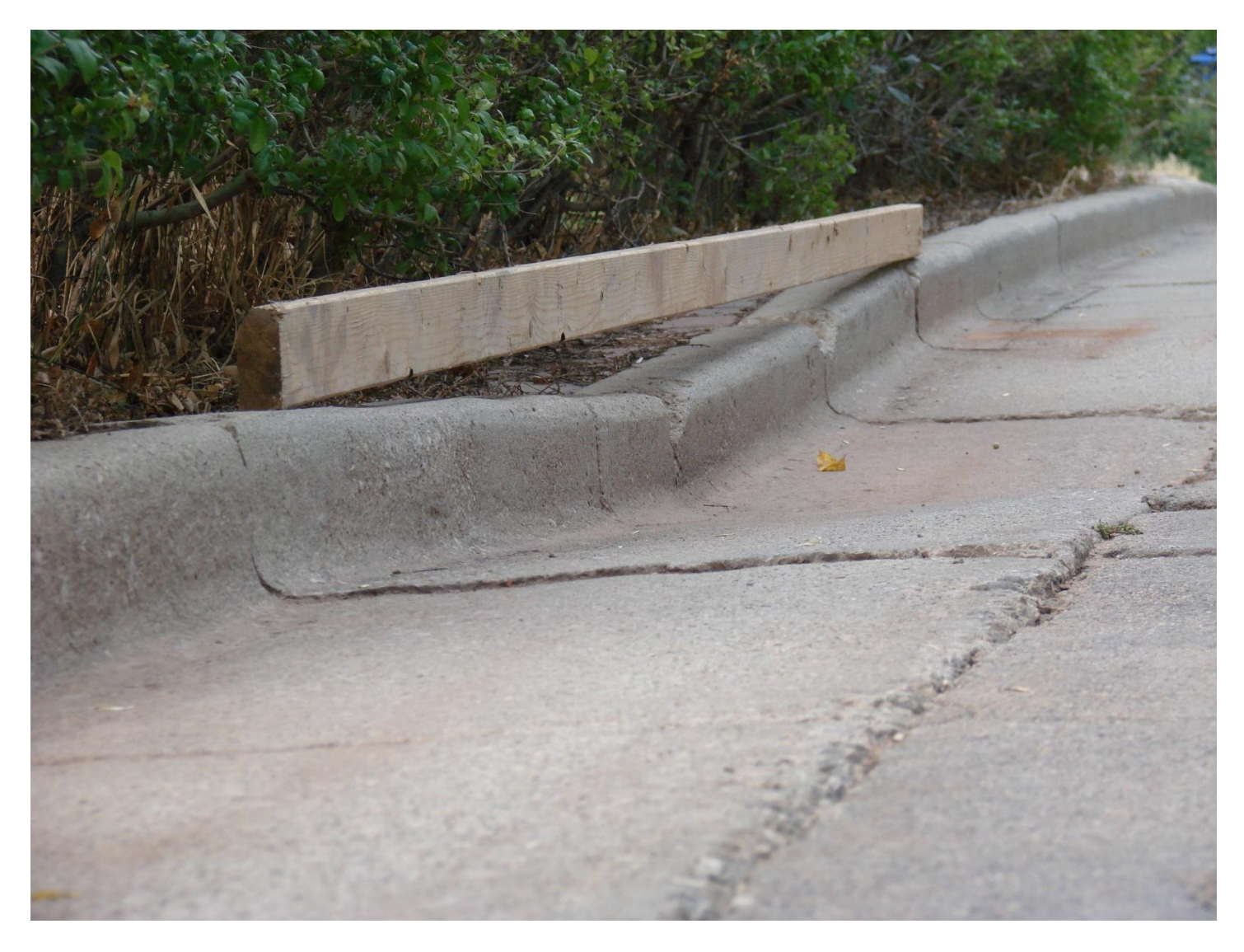
Exhibit 4 Condition of Curb at Subject Address