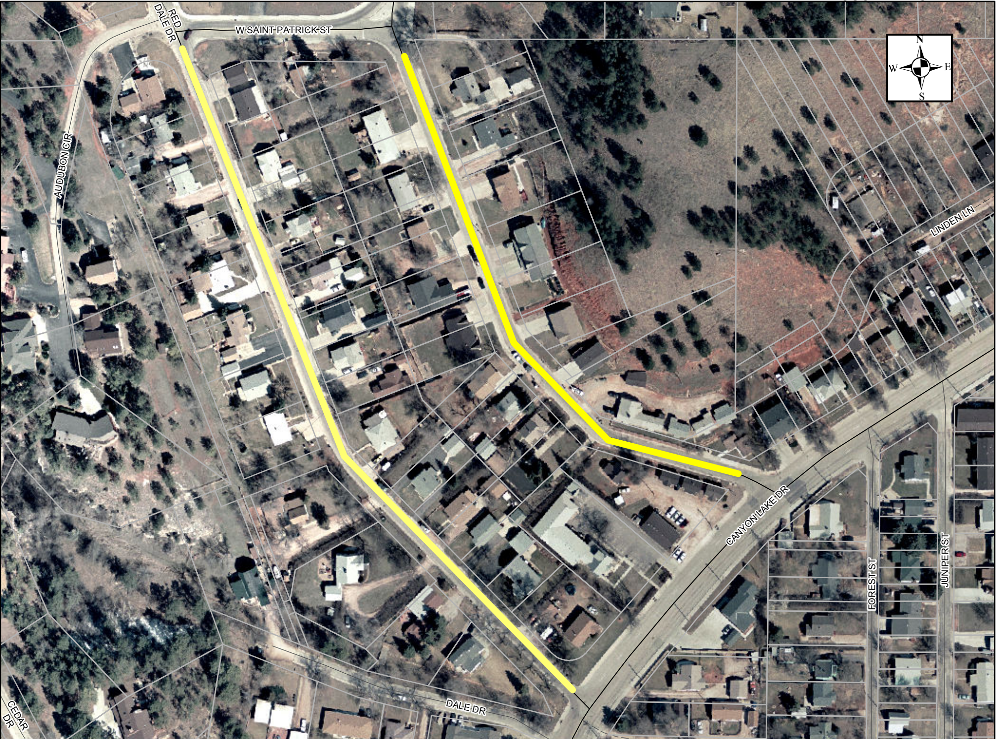
RED DALE & HILLSVIEW SIDEWALK