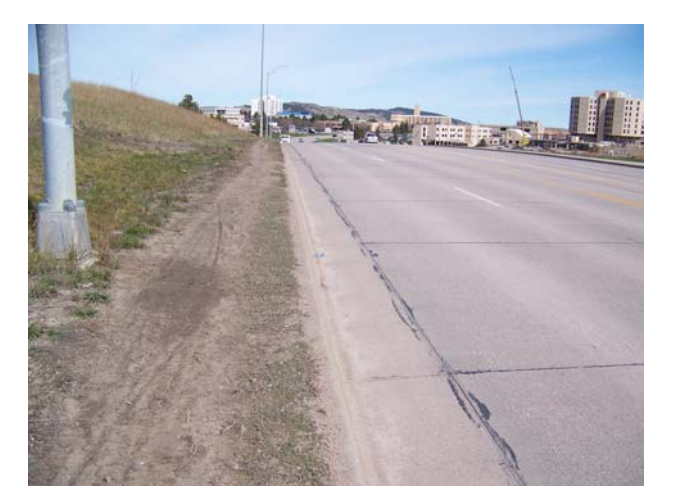
Shows lack of shoulder to serve as a buffer between foot– and vehicle traffic.