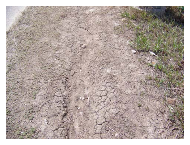
Shows how worn the path is relative to surrounding land.