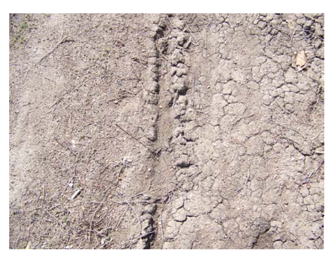
More bicycle tracks through the mud.