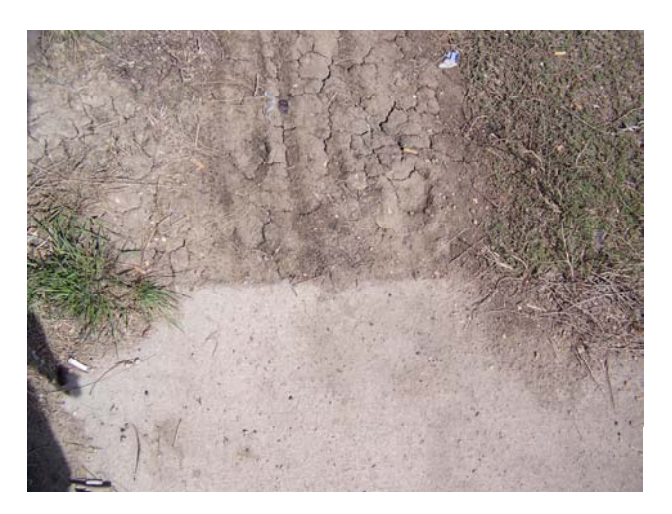
End of sidewalk at Black Hills Oral/ Maxillofacial Surgery Clinic.