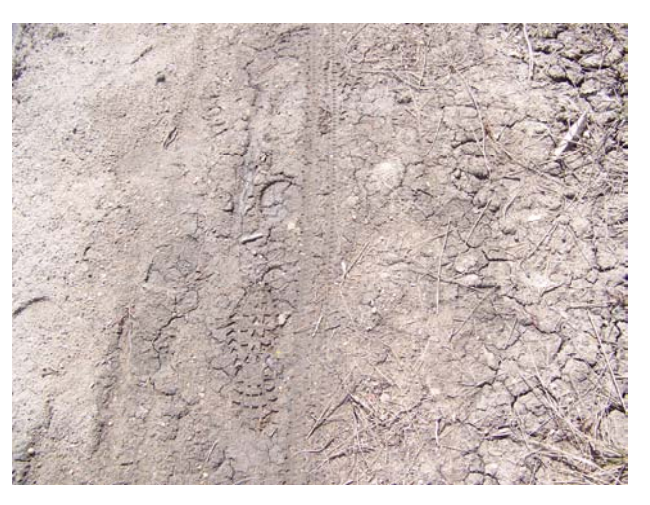
Although I've never seen a cyclist personally, here we can see both pedestrian and bicycle tracks.