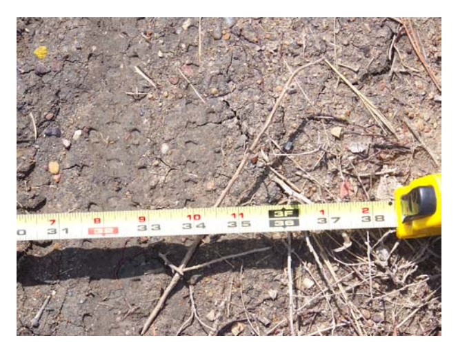
Blown up from previous photo—only 3 feet separate pedestrians from traffic in wet and icy conditions.