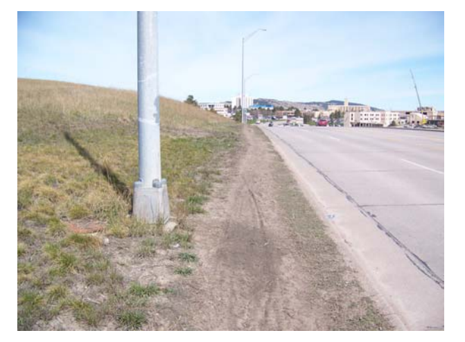
View looking north from Black Hills Oral/Maxillofacial Surgery Clinic.