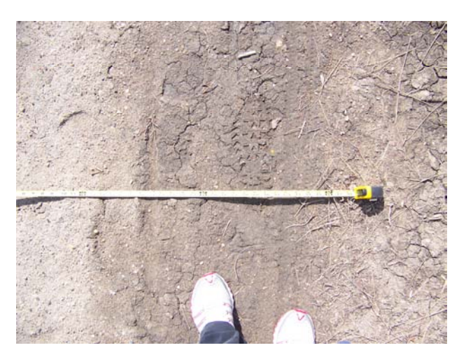
Shows narrowest distance between center of dirt path and a shoulderless road.