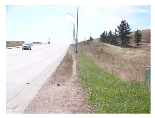
Looking south from the point where existing sidewalk ends at Dakota Radiology property.