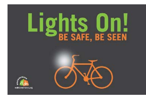
Figure 67. A Bike Light Campaign with free light giveaways is a win-win situation: bicyclists get free lights, and streets and paths get safer.

The majority of bicycle related crashes in the Rapid City Area occur in the fall as the skies get darker earlier, daylight savings ends, and bicyclists are harder to see. Many bicyclists, especially students, are unaware that lights are required by law, or they have simply not taken the trouble to purchase or repair lights. Research shows that bicyclists who do not use lights at night are at much greater risk of being involved in bike-car crashes.