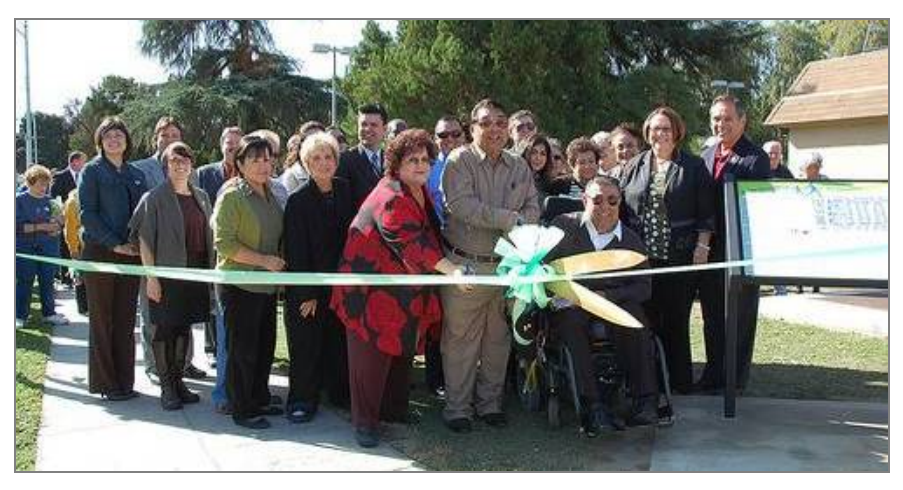
Figure 65. A launch party informs residents about a new facility and provides an opportunity for additional outreach.

When a new bicycle or pedestrian facility is built, some residents will become aware of it and use it, but others may not realize that they have improved options available to them. A launch party/campaign is a good way to inform residents about a new bike or pedestrian facility, and can also be an opportunity to share other bicycling and walking information (such as maps and brochures) and answer resident questions. It should be a mediafriendly event, with elected official appearances, ribbon cuttings, and a press release that includes information about the new facility, other facilities and support services, and any timely information about bicycling or walking (such as Bicycle Friendly Community designation, an increase in bicycling or walking mode share or user counts, etc.).