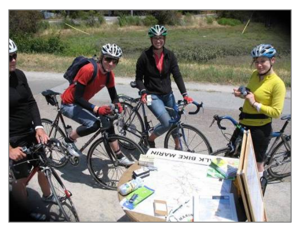
Figure 66. A "Share the Path" campaign encourages respectful behavior on multi-use paths.

Conflicts between path users can be a major issue on popular, well-used pathway systems like the Leonard "Swanny" Swanson Memorial Pathway. Communities around the country have launched successful "Share the Path" programs to help educate users about safety and courtesy. Share the Path campaigns can be run by agencies, nonprofits, or any user group (equestrian, hikers, etc.). These programs educate users about expected behavior and how to limit conflicts. Volunteers often give out brochures and engage with users in a nonconfrontational way. Volunteers can also report back to agencies about path maintenance or safety/security issues. Media outreach should be included as well. Common strategies include a bicycle bell or bike light