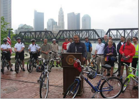
Figure 60. Bike Month activities build excitement around bicycling, and are an opportunity for novices to get support and encouragement.

A sampling of National Bike Month activities include: