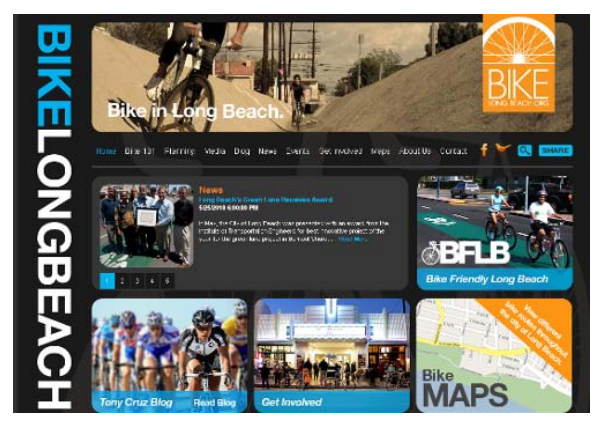
Figure 63. A comprehensive walk/bike website provides "one-stop shopping" for walking and bicycling information.

Many current and potential bicyclists and pedestrians do not know where to turn to find out about bicycling and walking laws, events, maps, tips, and groups. The City of Rapid City should develop a "one-stop shopping" website with comprehensive bicycling and walking information.