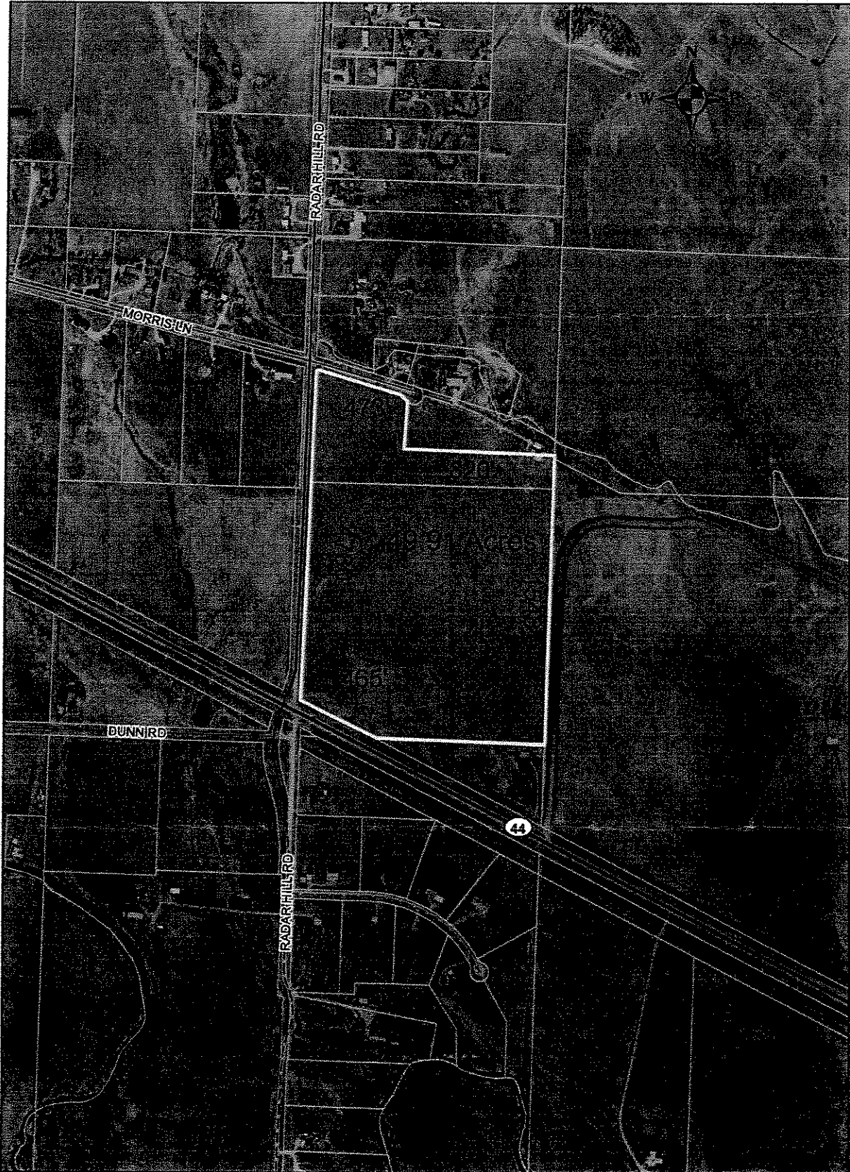
LOT B OF LOT 1