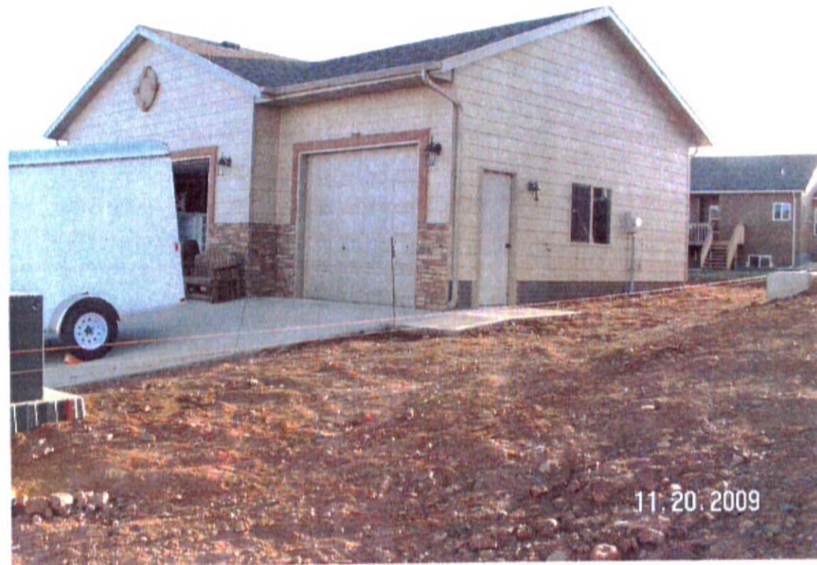
West Side Yard