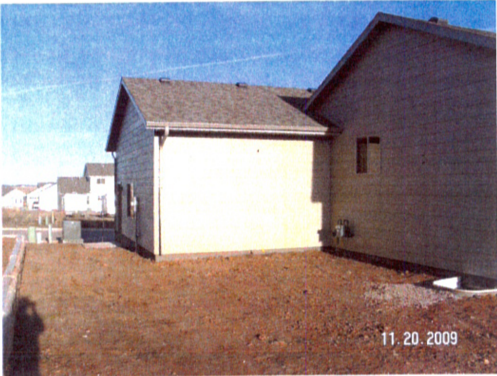
6515 Southwest Corner