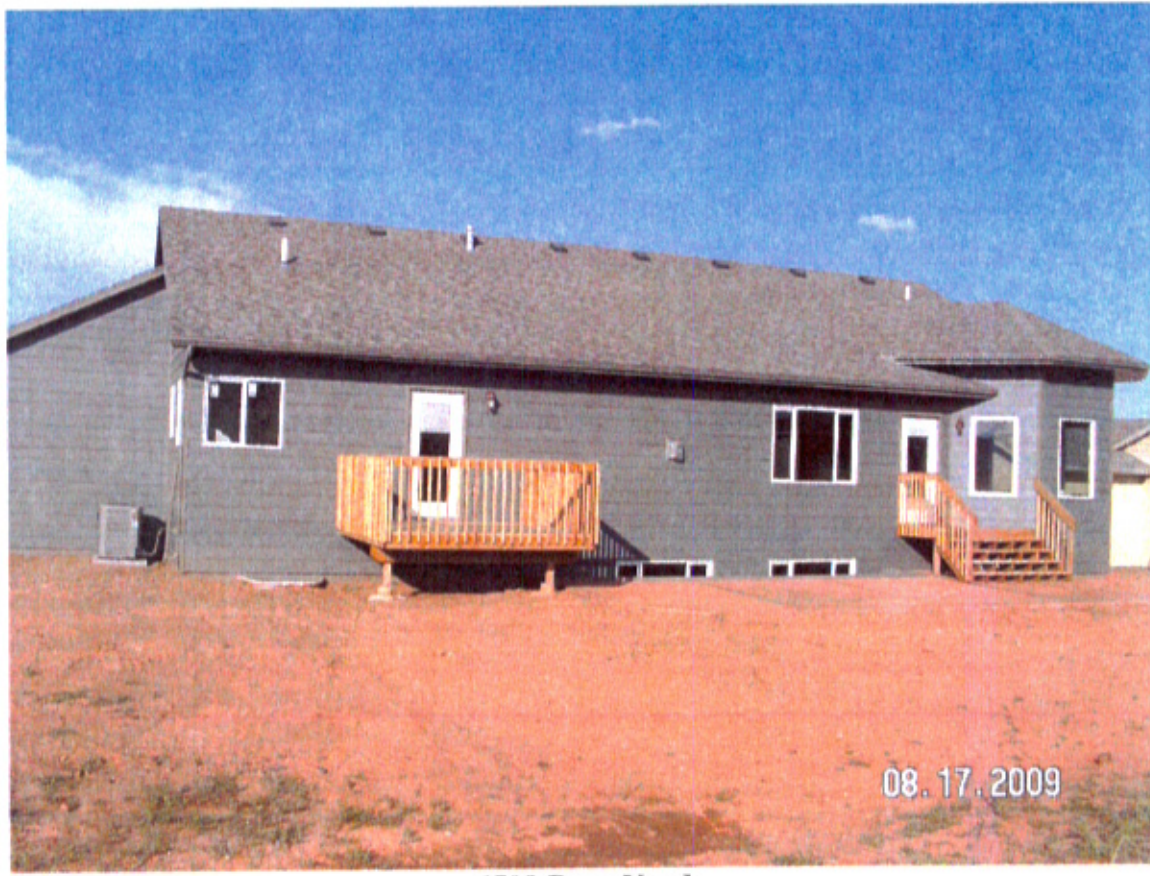
6509 Rear Yard