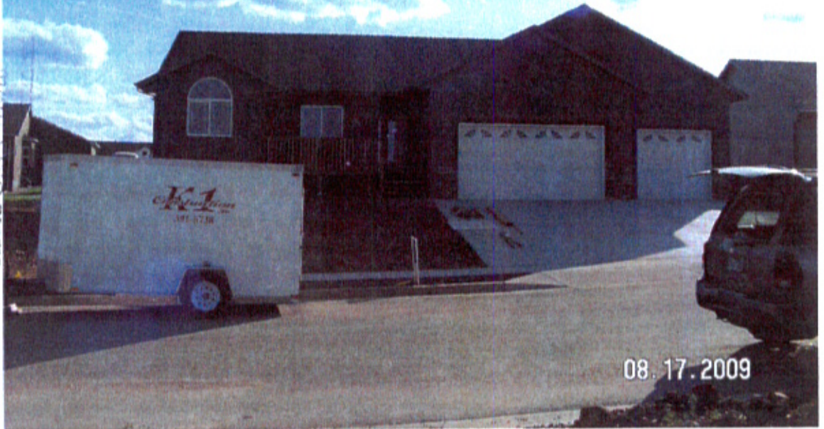
6509 Front View