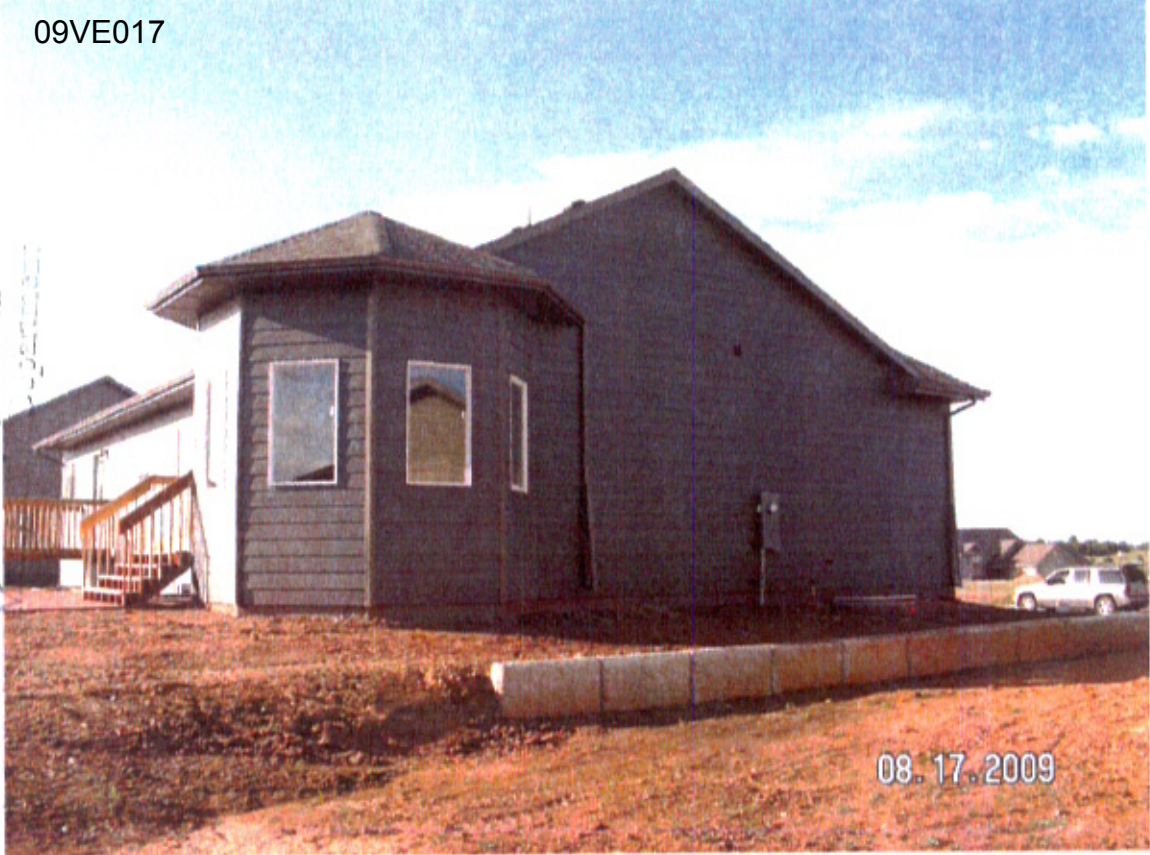
6509 Side Yard – East