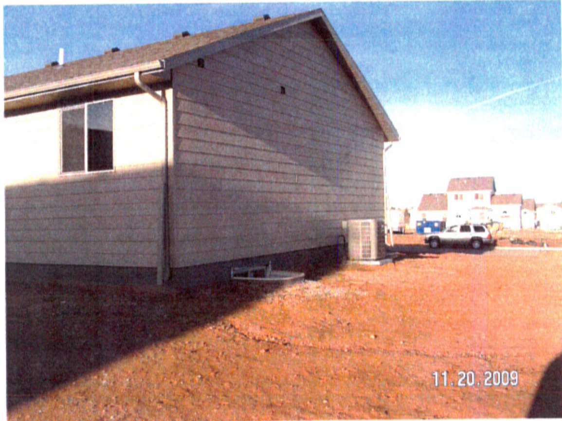
6515 East Side