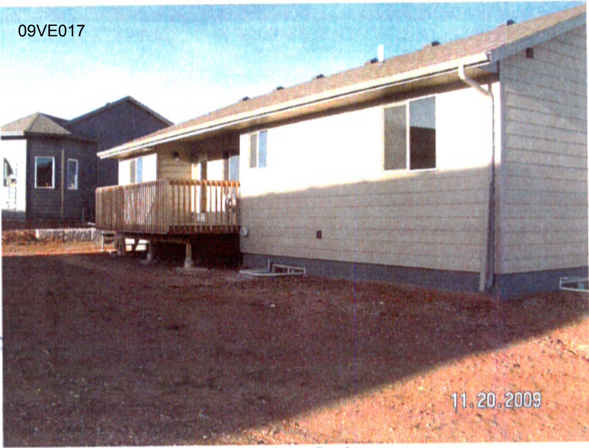
6515 Rear (South)