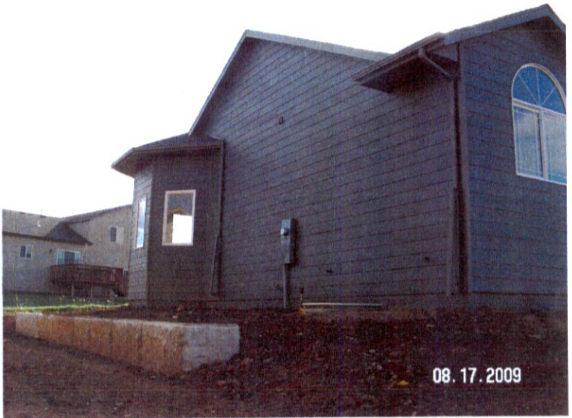
6509 Side Yard – East