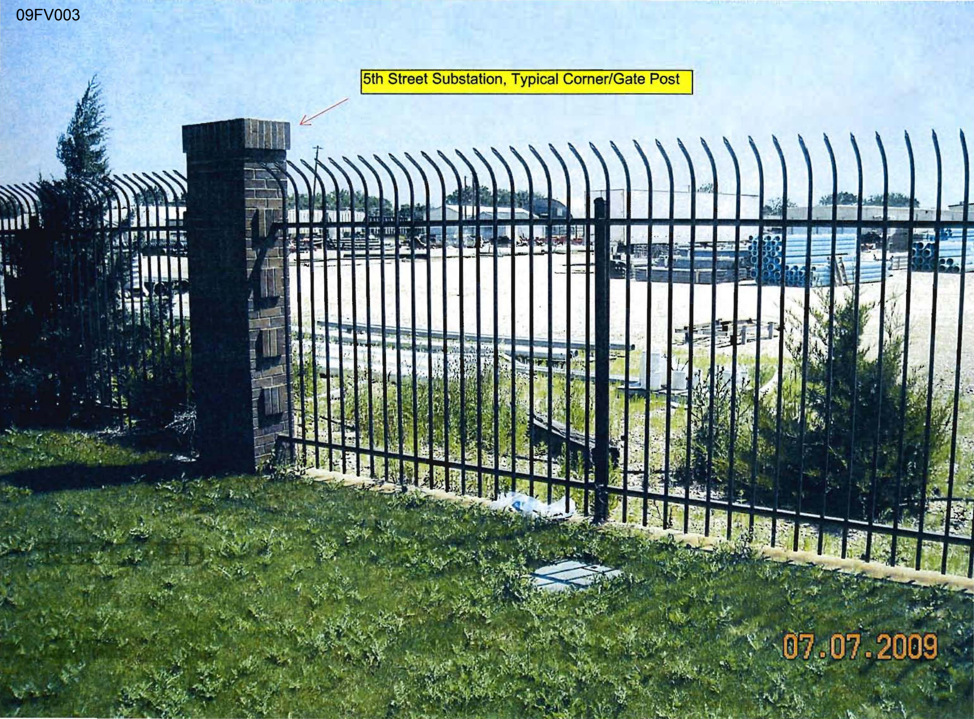
5th Street Substation, Typical Corner/Gate Post