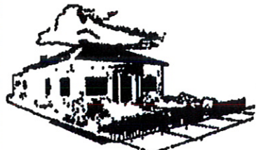
CITY HALL 1903