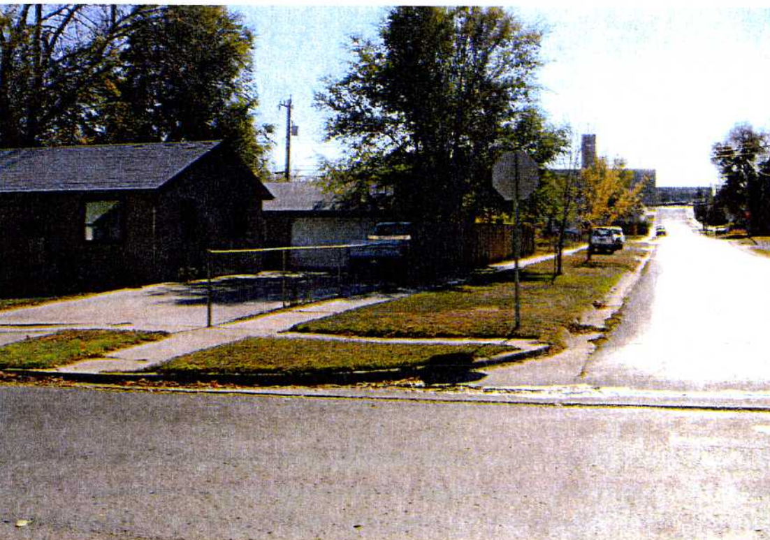
CORNER LOT WITH SIMILAR FENCE IN NEIGHBORHOOD