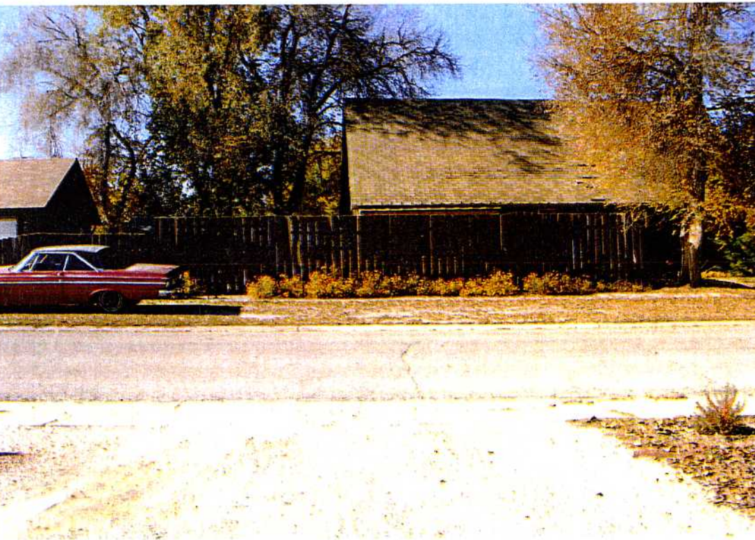
HOUSE DIRECTLY ACROSS