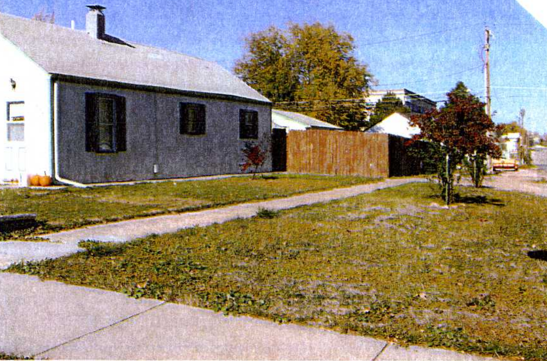
CORNER LOT IN NEIGHBORHOOD