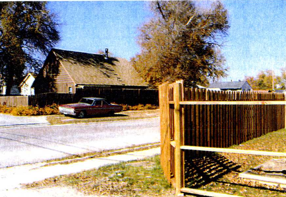
HOUSE DIRECTLY ACROSS HAS 1' HIGHER FENCE AND RUNS LENGTH OF THE PROPERTY