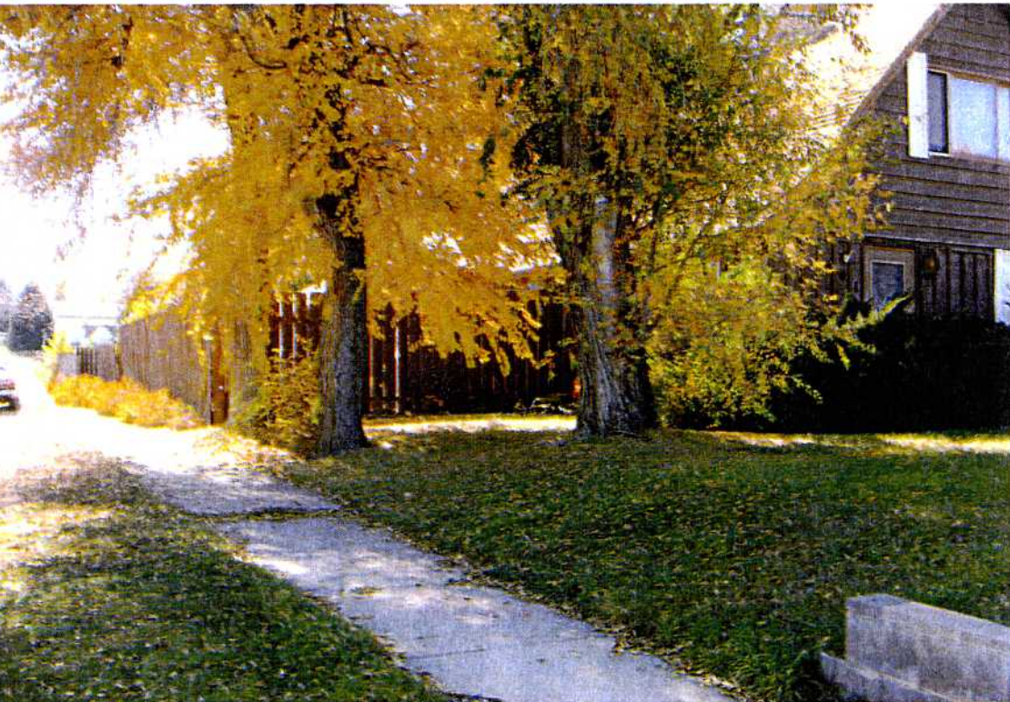
DIRECTLY ACROSS FROM 519 INDIANA ST.