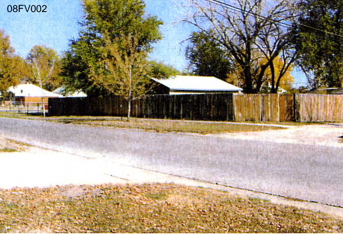
CORNER LOT WITH SIMILAR FENCE IN SAME NEIGHBORHOOD