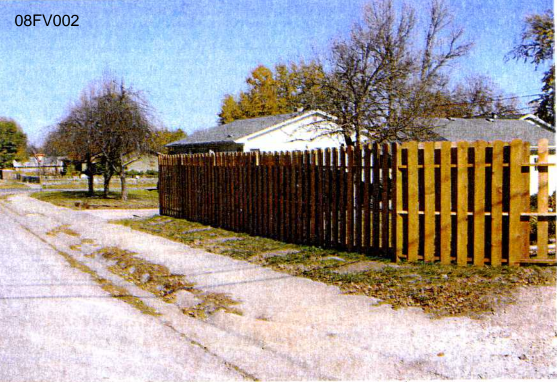
BACKYARD FENCE ANGLE FOR SIGHT