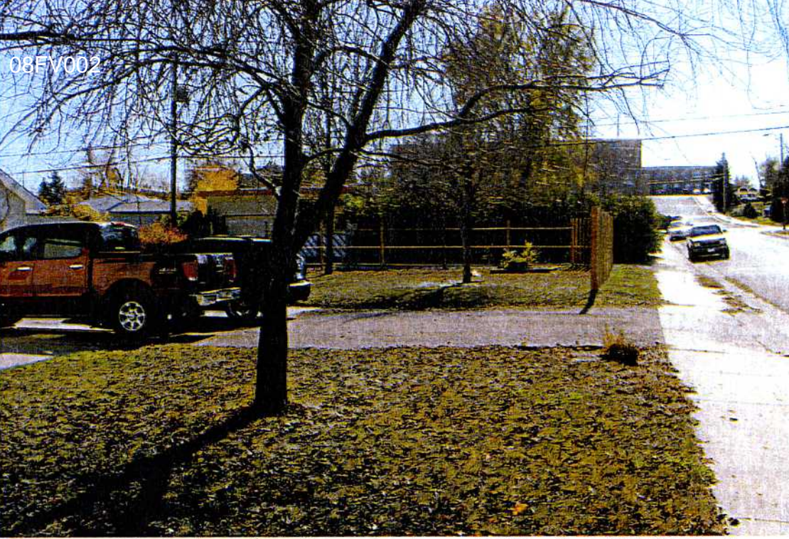
SHOWS BEN'S GARAGE AND WHAT IS CONSIDERED BACKYARD-IF YOU NOTICE THE NEIGHBOR'S HEDGE IS MORE OR A SLIGHT HINDERANCE