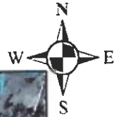
FIGURE 2 PHASE II CANYON LAKE DRIVE SIDEWALK INSTALLATION (2008)