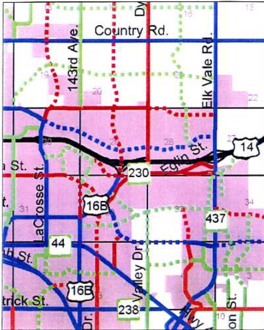
EXISTING MAJOR STREET PLAN