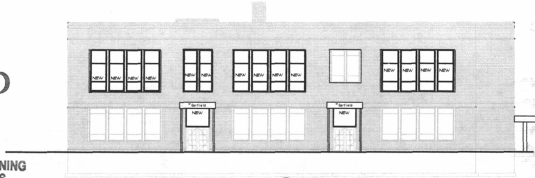
4 EAST ELEVATION A3.0 SCALE 1/8" = 1'-0"