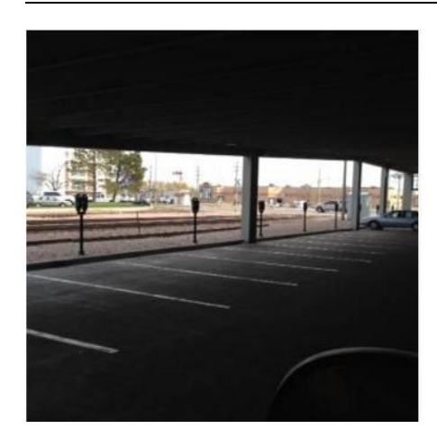
City parking ramp 72 vacant stalls