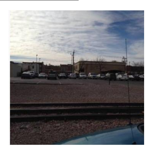
Lot #7 leased lot 32% vacant