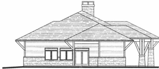
SOUTH ELEVATION 1/8" = 1'-0"