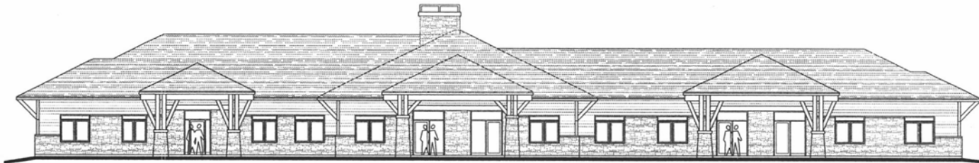
EAST ELEVATION 1/8" = 1'-0"