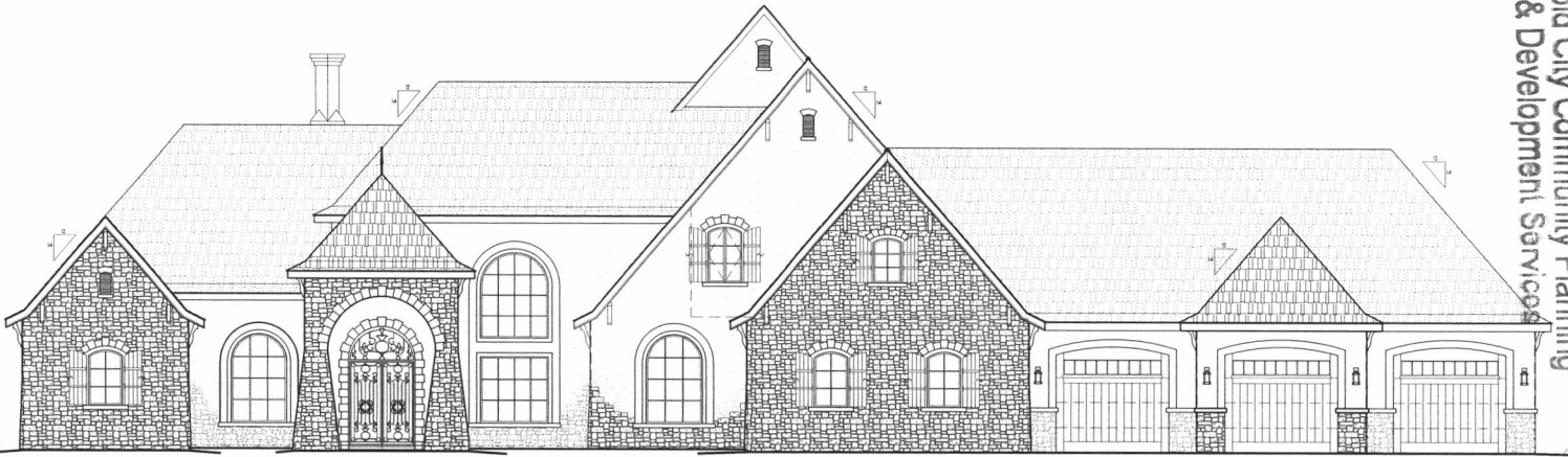
FRONT ELEVATION SCALE 3/16"=1'-0"