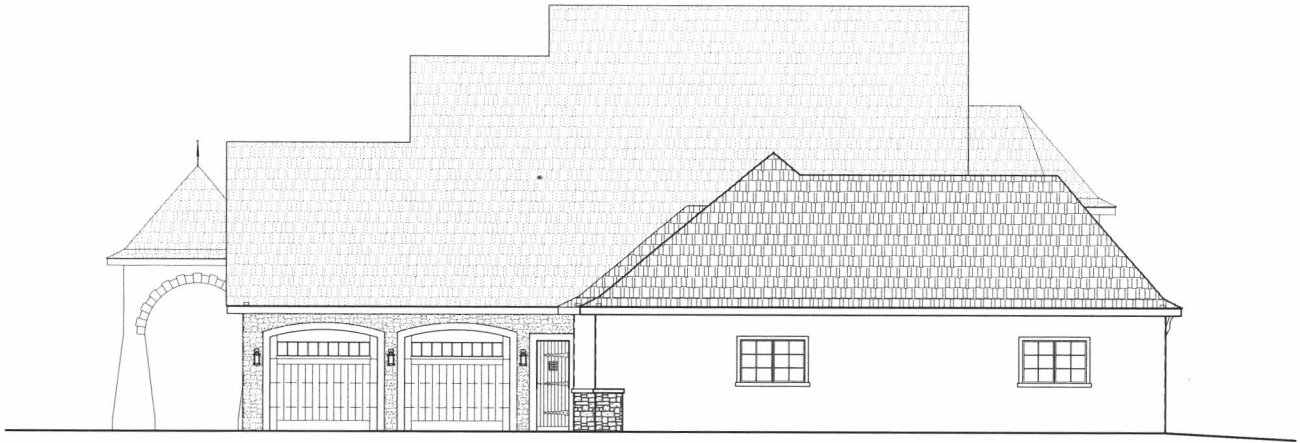
RIGHT ELEVATION SCALE 3/16"=1'-0"