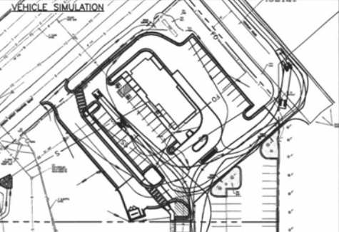
TRUCK TURNING VEHICLE SIMULATED