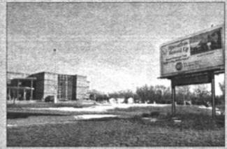
EXISTING PYLON SIGN AND ELECTRONIC READER BOARD TO REMAIN - NO CHANGES

TOTAL BUILDING SIGNAGE = 64 S.F. TOTAL ALLOWED = 590 x 2 = 1,180 S.F.