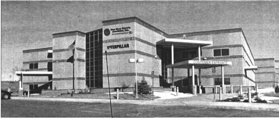
VIEW SOUTH ELEVATION