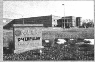
EXISTING DIRECTIONAL SIGNAGE ADD TENANT NAME

ARCHITECT: ARC HITECTURE INTERNATIONAL 2800 WEST 14TH AVE. SUITE 400 RAPID CITY, SOUTH DAKOTA 57701 TEL: 605.343.2344 FAX: 605.343.2400 BRINGING ARCHITECTURE TO YOUR WORLD