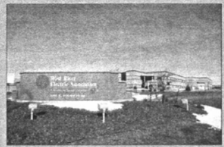
EXISTING MONUMENT TO REMAIN - NO CHANGES