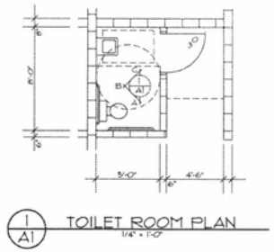
1 TOILET ROOM PLAN 1/4" = 1'-0"

NOTE: SOAP DISPENSER, WASTE RECEPTACLE, TOILET & PAPER TOWEL DISPENSER UNITS TO BE FURNISHED BY PRODUCT SUPPLIERS & INSTALLED PER A.D.A. REQUIREMENTS.