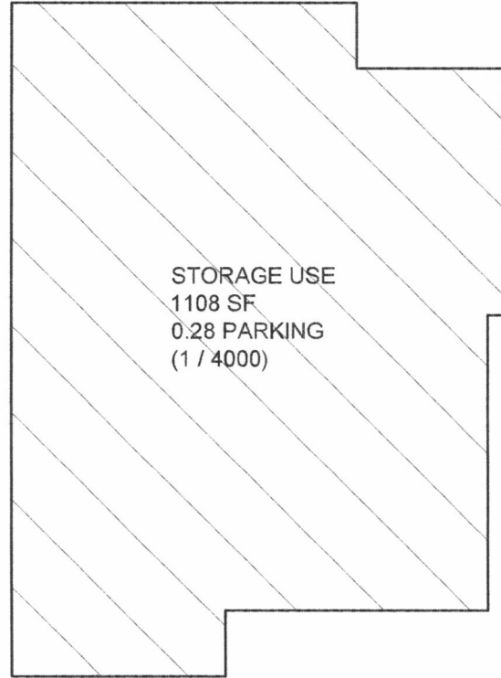
BASEMENT USE PLAN SCALE: 1/8" = 1'-0"