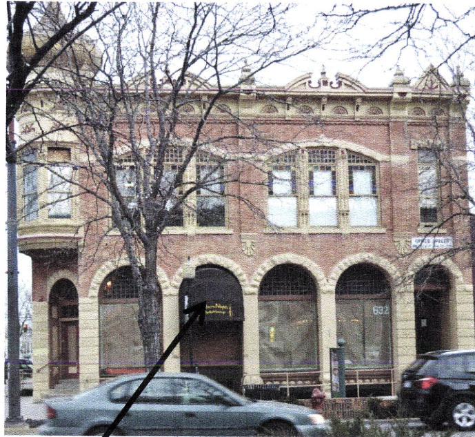
Brown awning is basement unit – VACANT as of 1/1/13