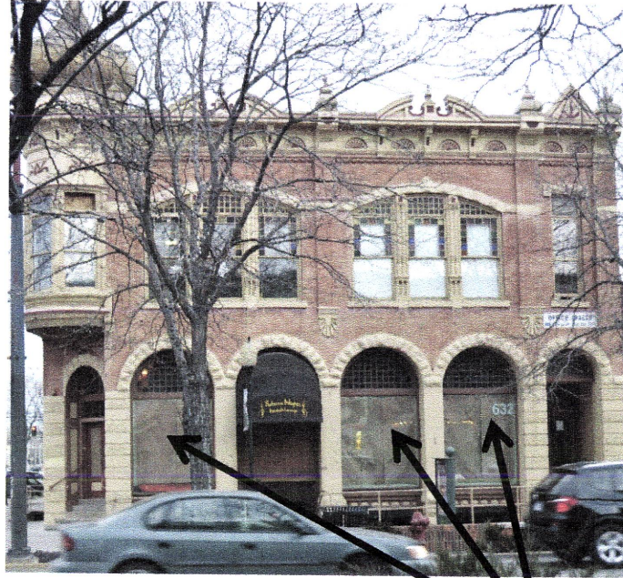
South side of Canvas 2 Paint

632 St. Joseph business location of applicant