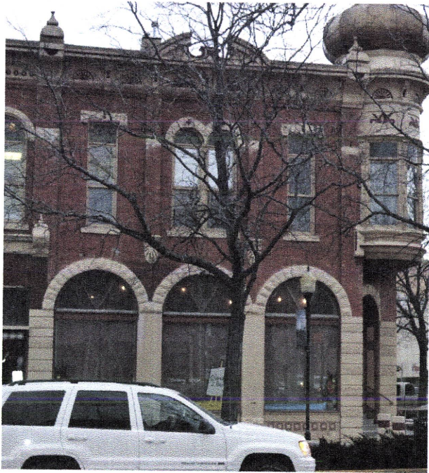
West side of Canvas 2 Paint