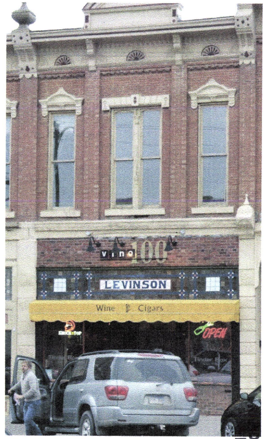
Second entrance for Tinder Box

CITY COMMUNITY PLANNING DEVELOPMENT SERVICES