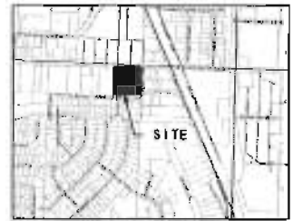
SCALE 1" = 800'