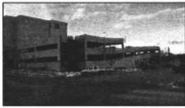
2 PHOTOS ALL NTS