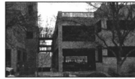
4 PHOTOS ALL NTS