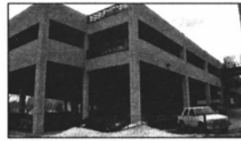
3 PHOTO ALL NTS