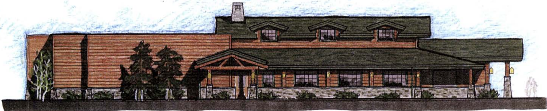
2 WEST ELEVATION