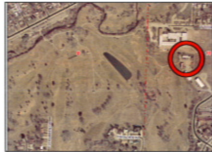
3 Neighborhood Overview SCALE 1" = 1/2"