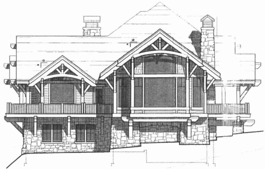
2 West Elevation A3.1 SCALE: 3/16" = 1'-0"