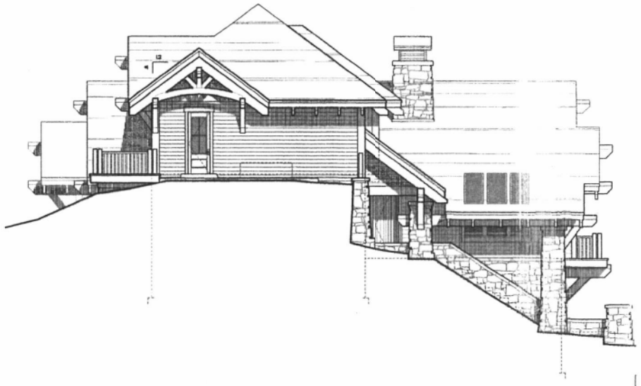
4 East Elevation A3.1 SCALE: 3/16" = 1'-0"