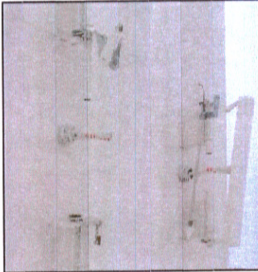
3 ANTENNA MOUNT PHOTO SCALE NONE