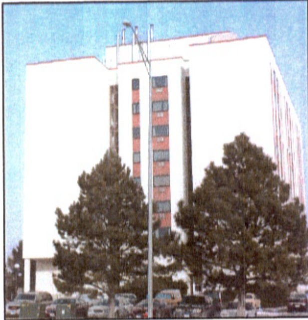
4 OVERALL PHOTO SCALE NONE