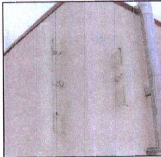
6 ANTENNA MOUNT PHOTO SCALE NONE