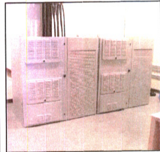
1 EQUIPMENT ROOM PHOTO SCALE NONE