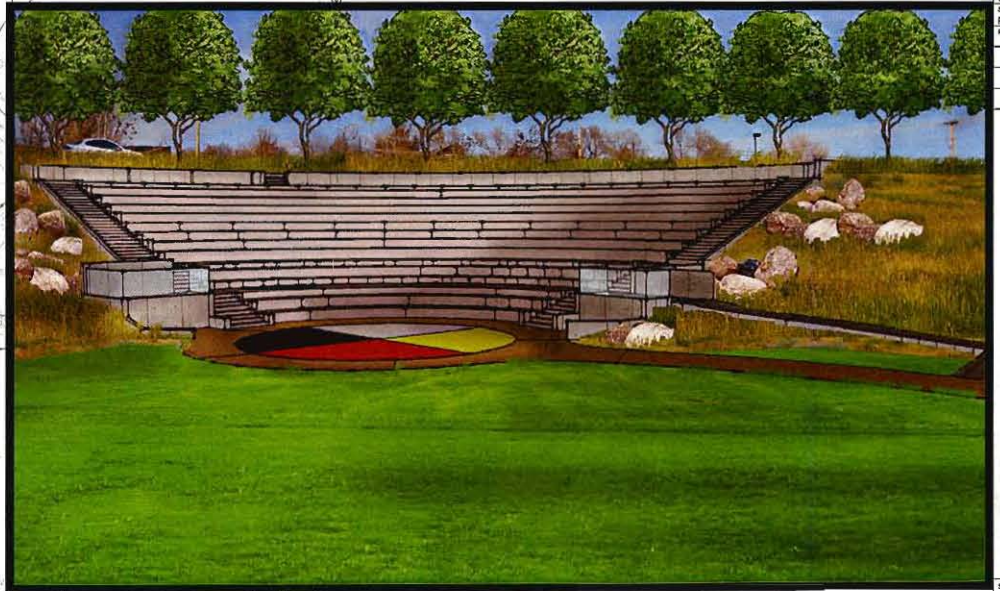
D ELEVATION OF AMPHITHEATRE