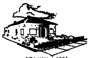
CITY HALL 1903

616 Sixth St. * Rapid City, SD 57701 * 605/721-7310 FAX: 605/721-7313 * E-MAIL: Gary@RennerAssoc.com * Spearfish 605/717-0016 *