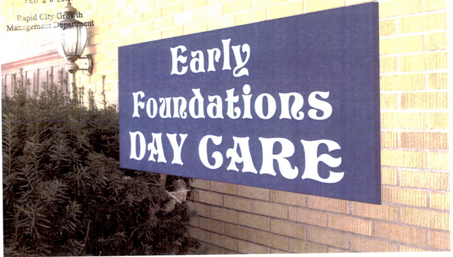
Plaque Cover: 30" x 73 3 / 4 "