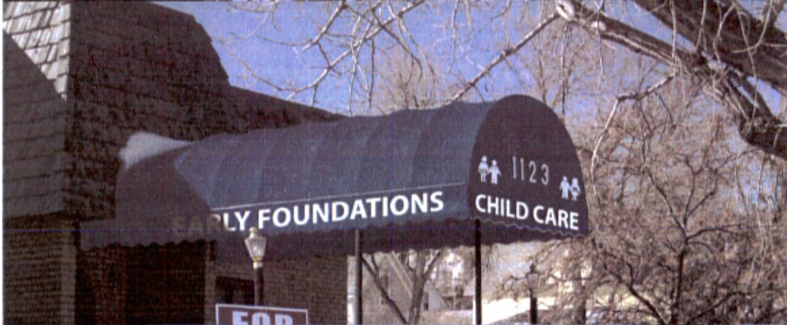
New Sunbrella fabric, Pacific Blue, copy and graphics