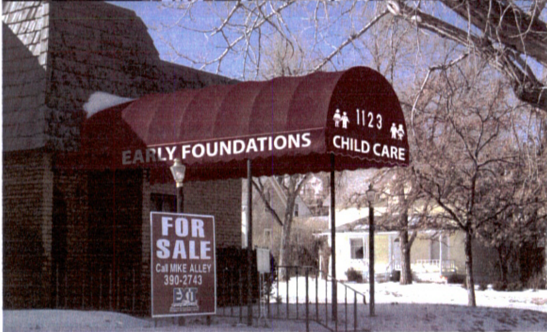
New Sunbrella fabric, Pacific Blue, copy and graphics