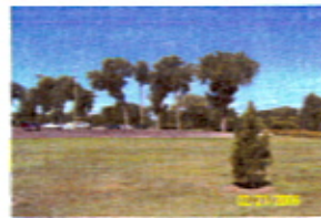
Elks from Jolly Lane looking NW