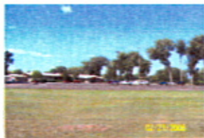
Elks from Jolly Lane looking west