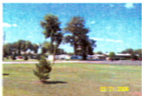
Elks from Jolly Lane looking SW