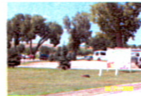
Signage at entrance to RV parking and Pro Shop