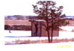
Shelter Typ of 3