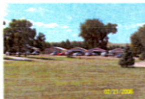
Elks Cart barns looking south from club parking lot