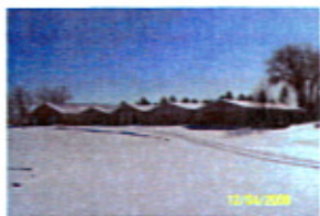
Cart Barns (a)