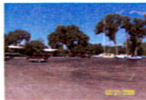
Elks front looking NW