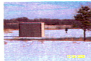
Shelter Typ of 3 (b)