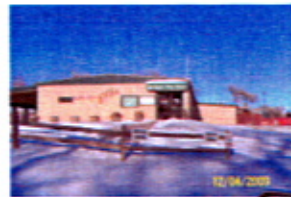
Pro Shop south view