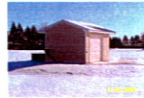
Pump House Typ of 2 (a)