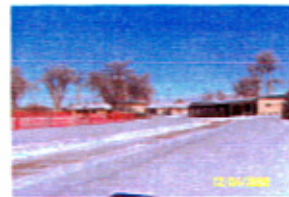
Over view Pro Shop and Lodge