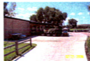
Looking south to front of Pro shop