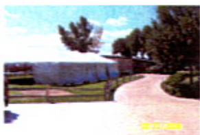
From new addition looking south to pro shop