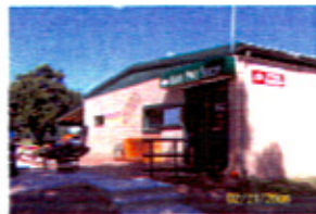
Pro shop looking NW