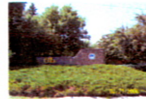
Signage at south entrance to Elks from Jolly Lane