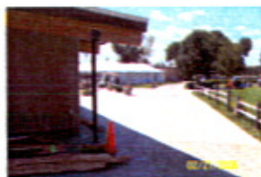
From new addition South to pro shop