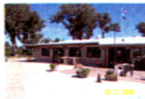
From South looking NE to new addition