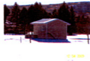
Pump House Typ of 2