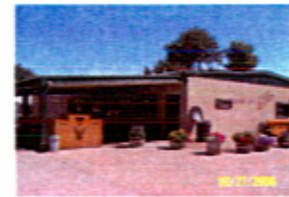
Pro shop looking NE