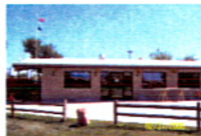
New addition from west looking east