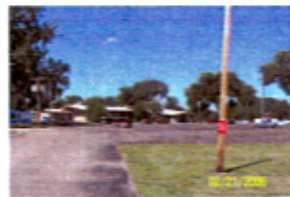
Elks entrance to parking looking west