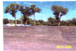
Elks parking looking North