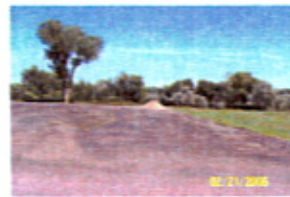
Elks parking looking NE