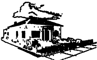
CITY HALL 1903

616 Sixth St. * Rapid City, SD 57701 * 605/721-7310 FAX: 605/721-7313 * E-MAIL: Gary@RennerAssoc.com * Spearfish 605/717-0016 *