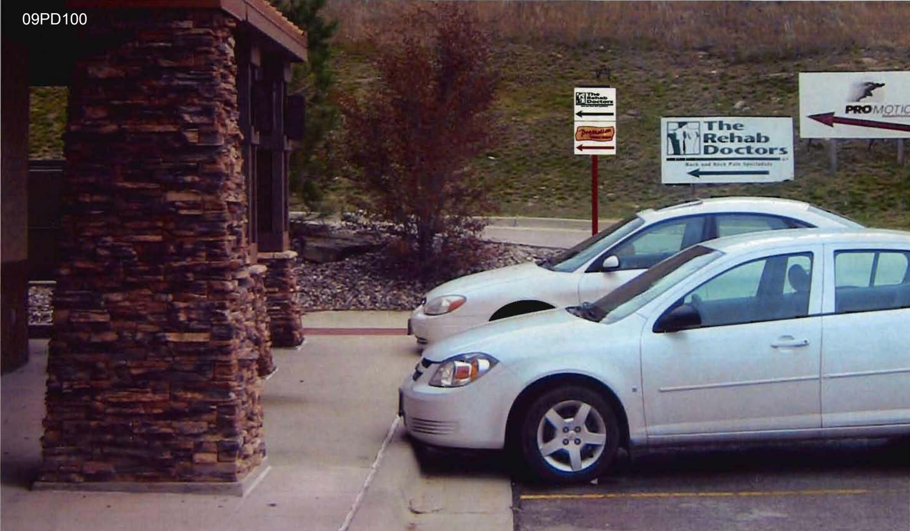
Aluminum signs - 24" x 30" mounted on a 2" sq. tube, painted burgandy (504C) Faces decorated with vinyl; burgandy (504C), green (336C) & gold OAH = 10', clearance = 6'