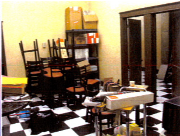
Back Room – Storage Space