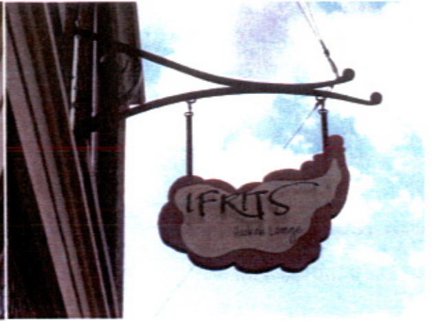
Ifrit's Signage Facing West