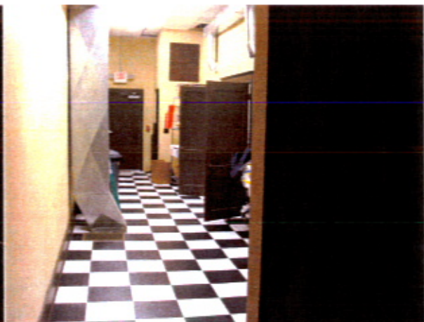
End of Lounge Area to Back Door