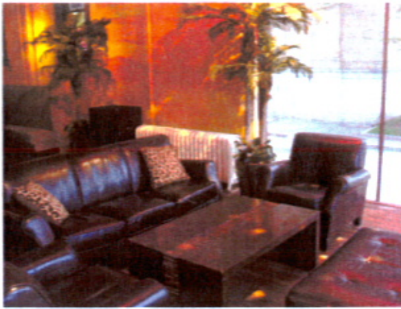
Front Couch Area