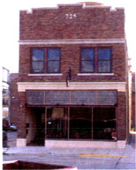
Alley (South) Face of 725 St. Joseph St.