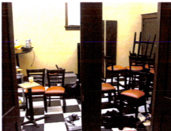
Shot of Back Room through Double Doors