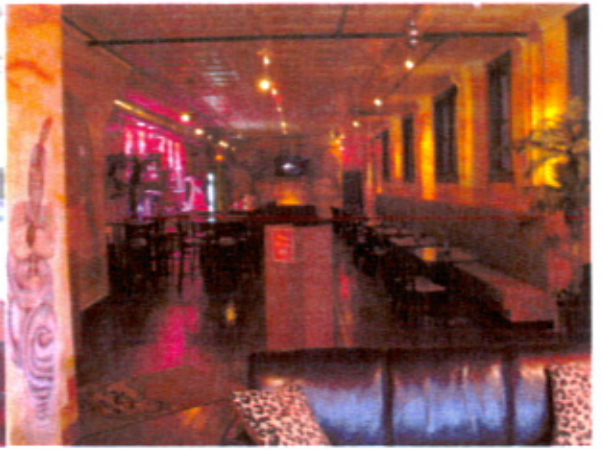
Picture from Front to Back