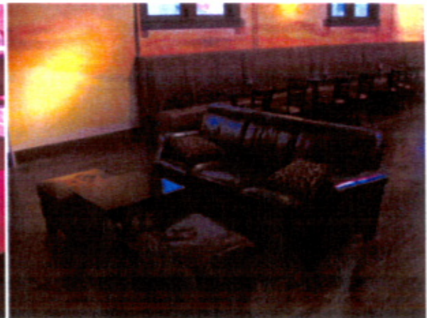
Back Couch Area