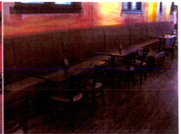
Booth & Table Seating