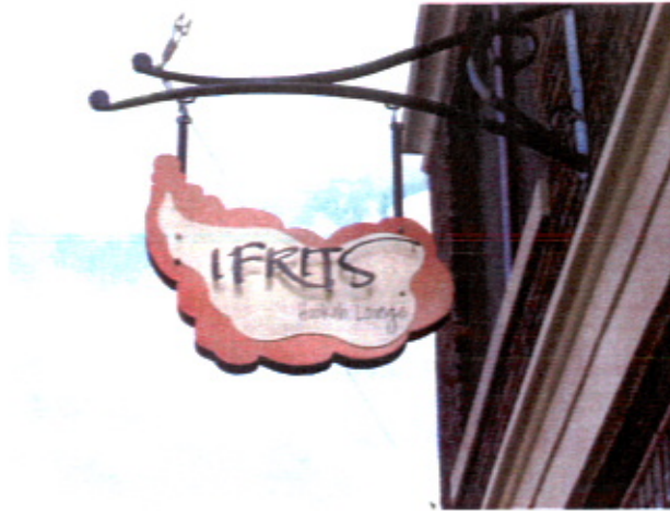
Ifrit's Signage Facing East