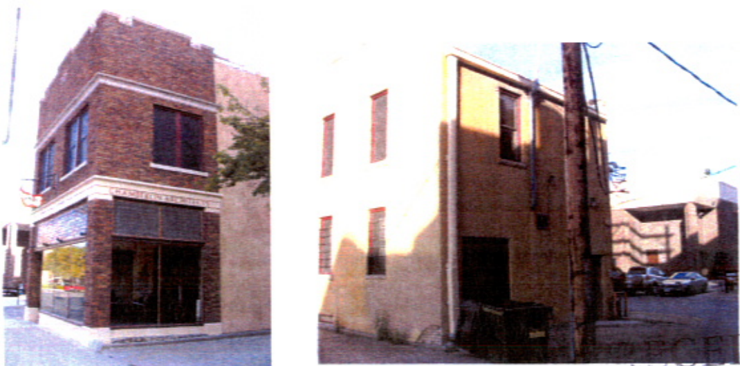
Additional Building Images