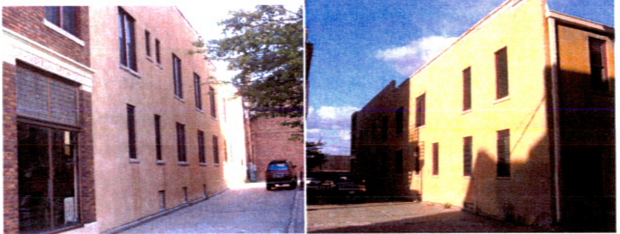
West Face of Building = 129'W x 30' H