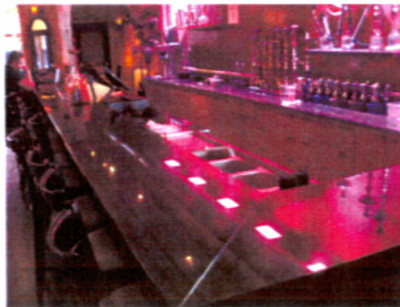
Picture of Bar