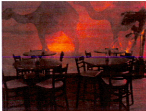
Round Tables by Bar