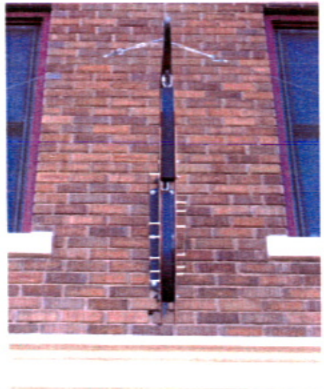
Straight On Shot

These are 4 pictures of the same sign – there is only one sign and it is on the front side of the building. The sign mount is 14' from the sidewalk. The mount extends 5' out from the building. The mount and sign are both constructed of steel. The dimensions of the sign are as follows: 2'8" W x 2' H x 2.5" D