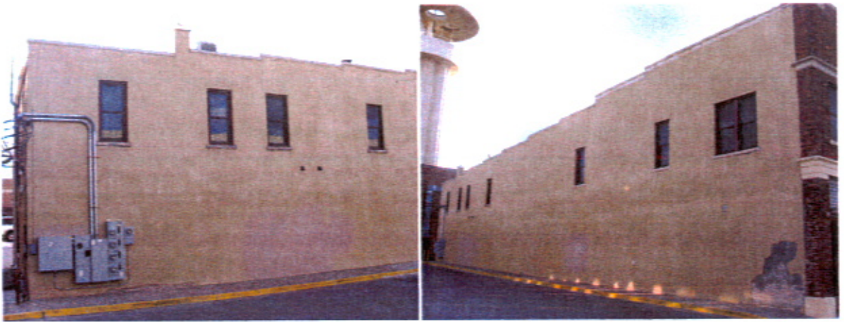
East Face of Building = 129' W x 30' H