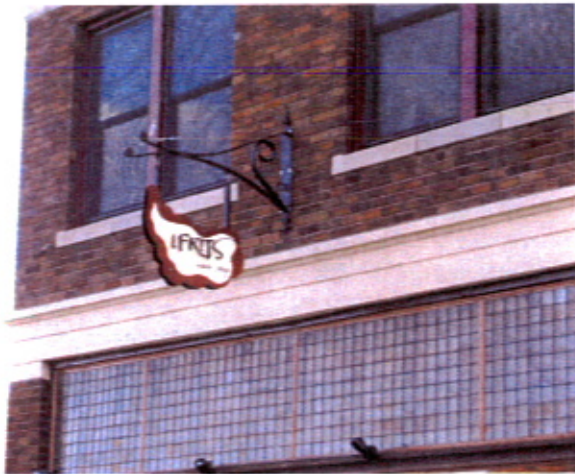
Wide Pan Shot