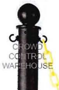
Post with "C" Hooks