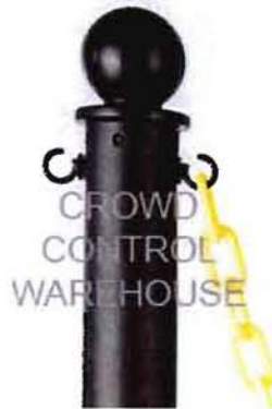
Post with "C" Hooks