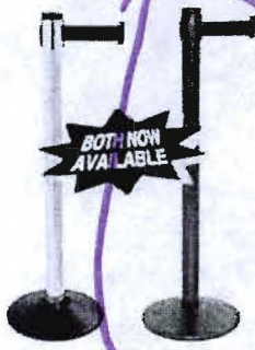
View More Images

MSRP: $109.99 Price: $69.95 You Save: 33%